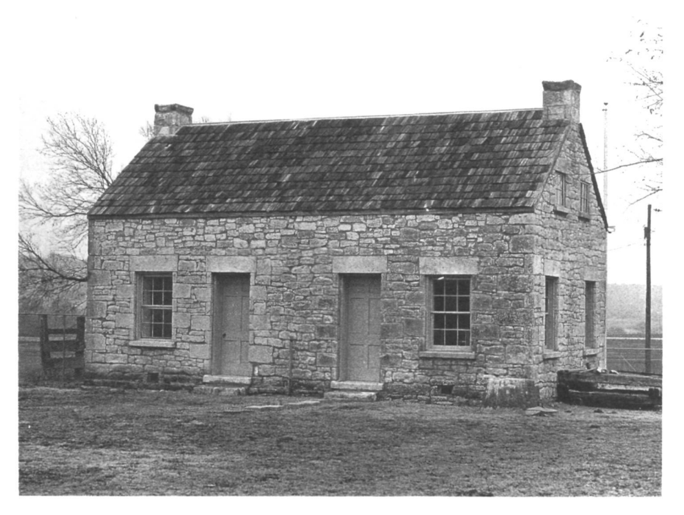
Copperas Cove Stagestop and Post Office, Copperas Cove vicinity, Texas, 1878. This fine example of vernacular stone construction in Texas is the only surviving structure from the original town of Copperas Cove. It served many functions, beginning as a stage relay station and post office. (Texas Historical Commission)

companies. Postal savings banks were authorized in 1910 in order to encourage thrift, increase the amount of money in circulation, and provide security, especially for those without access to banks. They became particularly popular during the Great Depression of the 1930s, when the government inspired greater confidence than private financial institutions.