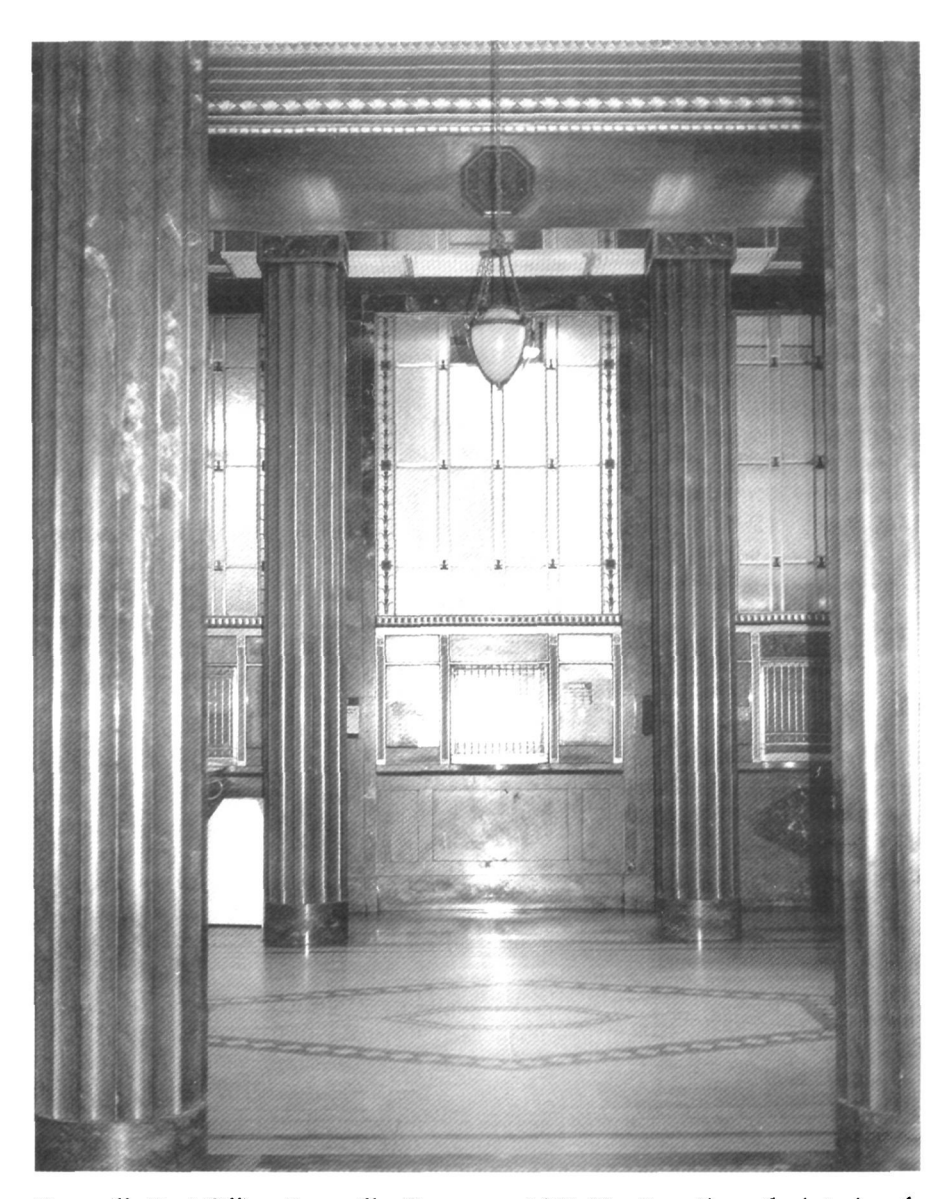
Knoxville Post Office, Knoxville, Tennessee, 1932-33. Sometimes the interior of a building may be as significant or more significant than its exterior. The Knoxville Post Office displays elaborate Art Deco detailing in its lobby, which is one of the most significant interior spaces in the city. (Thomason and Associates)