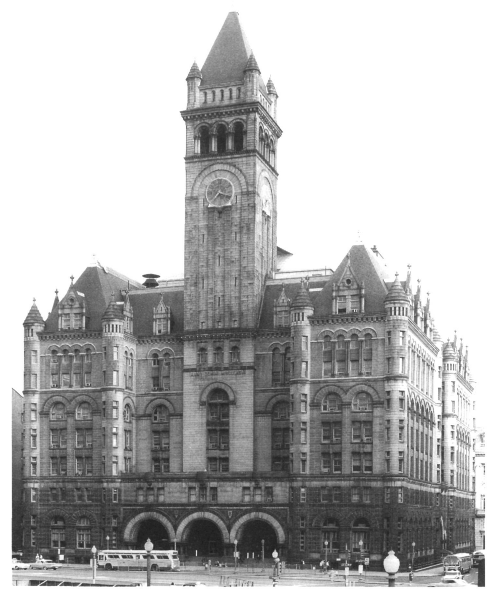
Old Post Office and Clock Tower, District of Columbia, 1891-99. One of Washington's few Romanesque Revival Buildings on a monumental scale, this was the city's third tallest building when completed, exceeded only by the Capitol and the Washington Monument. The Old Post Office was the first Federal building erected in the area now known as the Federal Triangle. It served as headquarters for every Postmaster General from 1899 to 1934. (William Edmund Barrett)

Post offices are important examples of this type of property. In order to facilitate the evaluation and nomination of post offices, the National Park Service conducted a study of various factors in the establishment, role, and design of post offices in order to establish a consistent policy for applying the National Register Criteria for Evaluation to these buildings. The study focused on the history of post offices prior to 1939 to accommodate the impact of major Federal programs of the Depression. The following guidance for evaluating the significance of post offices using the National Register Criteria resulted from this study. This second edition of National Register Bulletin 13 also looks at post offices built after World War II. This publication is intended to assist anyone in the evaluation of the eligibility of post offices for inclusion in the National Register, and to suggest an appropriate approach for evaluating other similar resources.