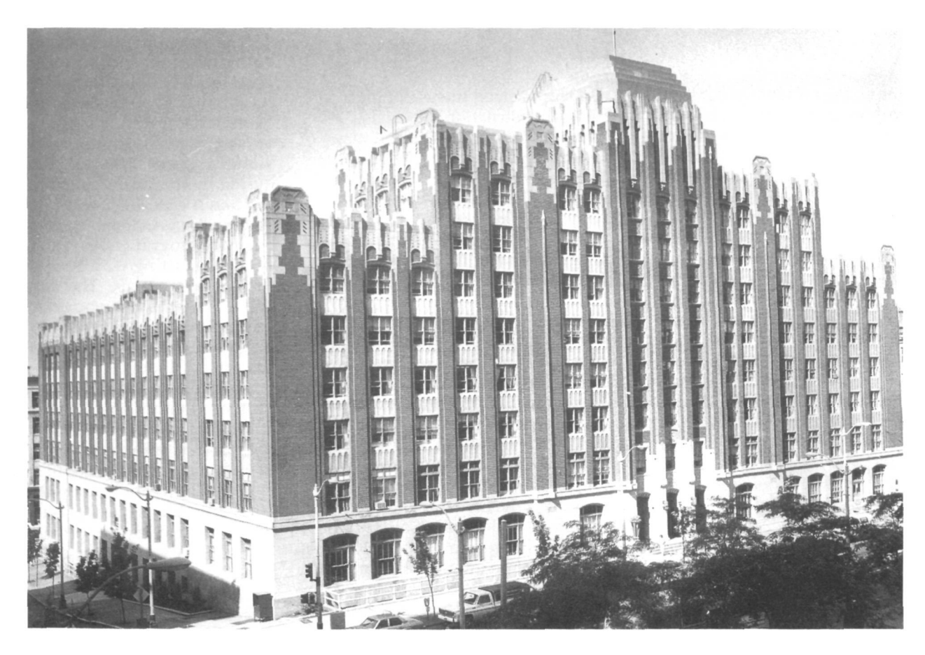
Federal Office Building, Seattle, Washington, 1932-33. In addition to being the city's first building designed especially for Federal offices, this was one of the first Modernistic-styled buildings designed by the Office of the Supervising Architect of the Treasury Department. The innovative use of cast aluminum spandrel panels beneath the windows was the first extensive use of aluminum on the West Coast. Much of the interior Art Deco ornamentation remains intact. (John Kvapil)

government programs supporting graphic arts during the Depression, the Treasury Department's Section of Painting and Sculpture (later the Section of Fine Arts) was the principal sponsor of art for Federal buildings, primarily post offices. Funds for artwork were based on 1% of the total appropriation for the building's construction. Unlike another major program, the Works Progress Administration's Federal Art Project, the Section's program was one of patronage rather than relief and stressed quality over mass production. Artists were selected through blind competitions, whose standards encouraged realism as the most appropriate style and scenes of everyday American life as suitable subjects. Placement of the commissioned murals and sculptures in public buildings resulted from the desire of leaders in the Administration to make original, quality art accessible to those who otherwise had little or no opportunity to see it. Local reactions to the newly installed works