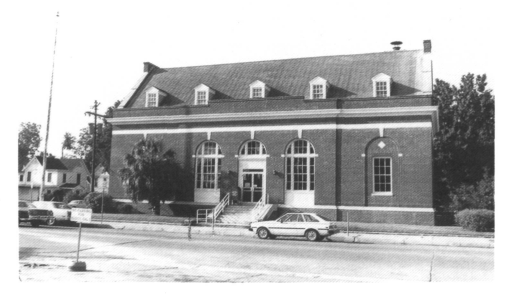
Jennings Post Office, Jennings, Louisiana, 1915. Representing a degree of stylistic sophistication unexpected in a small town in rural Louisiana as early as 1915, the Jennings Post Office is noted for its progressive design in a commercial center otherwise characterized by more modest vernacular buildings. (Jonathan Fricker)

The first step in evaluating a potential historic property is to identify the type, functions, and history of the property being considered. The basic information to obtain for a post office, which falls into the National Register category "building," includes dates of