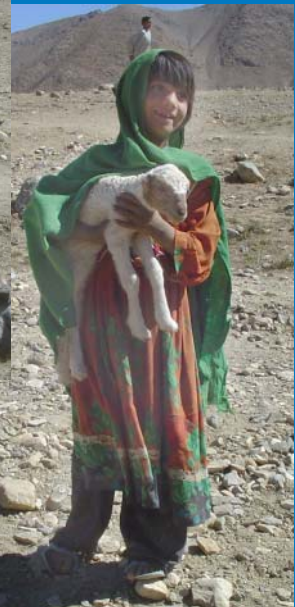
(Below) A girl brings her lamb to be vaccinated.