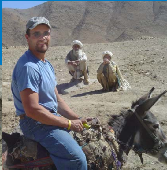
(Above) A common form of transportation due to the lack of infrastructure.