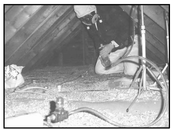
Figure 33: Wet Simulation in Attic of Vermont House - Versar Employee Spraying Water on Attic Insulation During Simulation.

Notes: Portion of stationary ambient air monitoring pump is visible in foreground. Personal air monitoring cassettes can be seen on Versar employee, oriented toward the breathing zone.