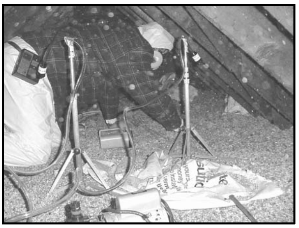
Figure 34: Dry Simulation in Attic of Vermont House - Versar employee manipulating attic insulation during simulation.

Notes: Portion of stationary ambient air monitoring pump is visible in foreground. Personal air monitoring cassettes can be seen on Versar employee, oriented toward the breathing zone.