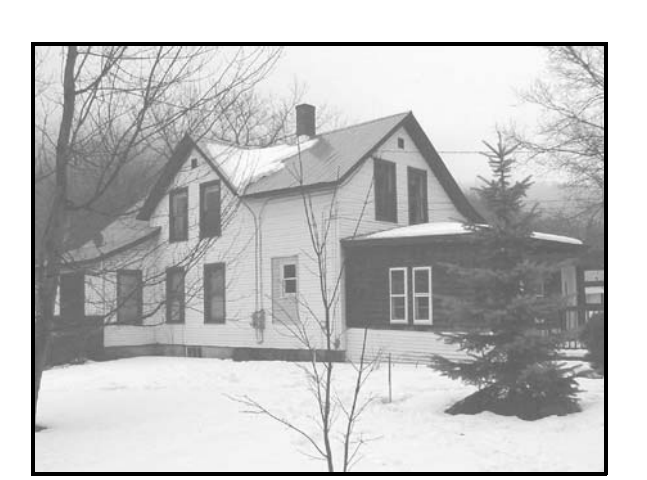
Figure 31: General View of Exterior of House in Bethel, Vermont