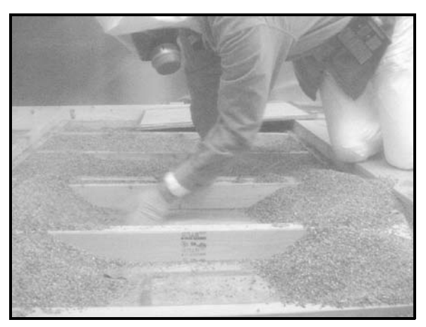
Figure 29: Vermiculite Being Cleared in Artificial Attic Space of Main Containment - Simulation of digging a trench to install electrical wiring.