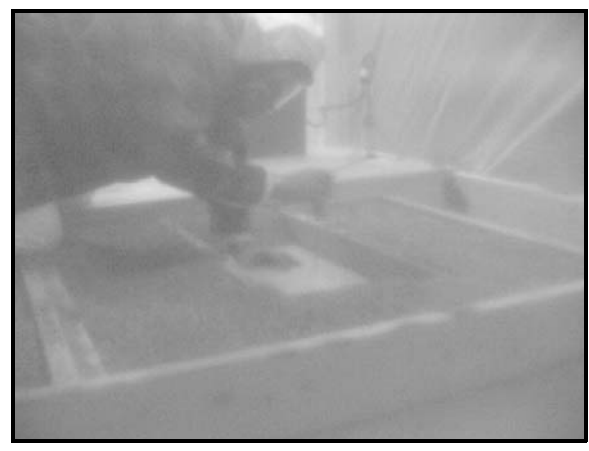
Figure 30: Hole Being Cut From Attic Space of Main Containment - Simulation of cutting a hole to install a ceiling fan.