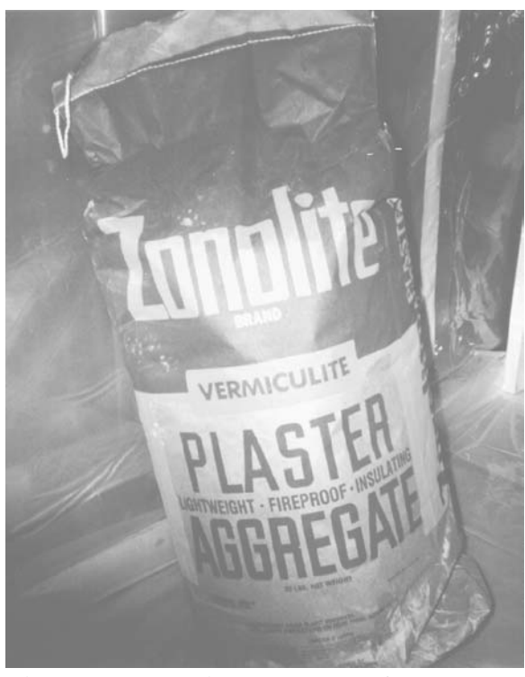
Figure 3: Zonolite Purchased from Miami, FL (Product No. 107235)