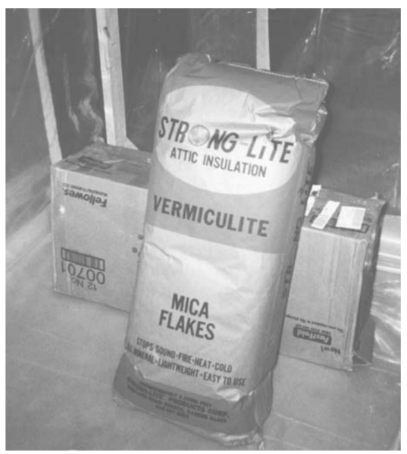
Figure 1: Strong-Lite Vermiculite Purchased from Arlington Heights, IL (Product 107227)