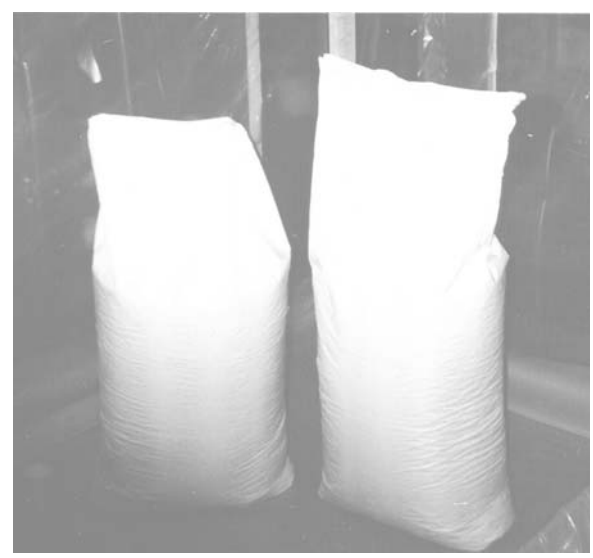
Figure 4: Vermiculite (with no label) purchased from Sacramento, CA (Product No. 107226)