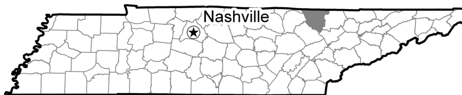
Figure 1.—Location of Scott County in Tennessee.

quantity of game and sold the furs, hides, oil, and tallow as far south as Natchez, Mississippi. The rugged topography and the lack of roads or easily navigable waterways, however, prevented settlement in the Cumberland Mountains prior to 1800. The earliest settlers were given land grants by North Carolina and Virginia as payment for their service in the Revolutionary War. When the State of Tennessee was admitted to the Union in 1796, land grants were issued to new settlers as well. Those who did not have land grants simply “squatted” or settled by what was called “cabin right,” which was later known as “tomahawk right.”