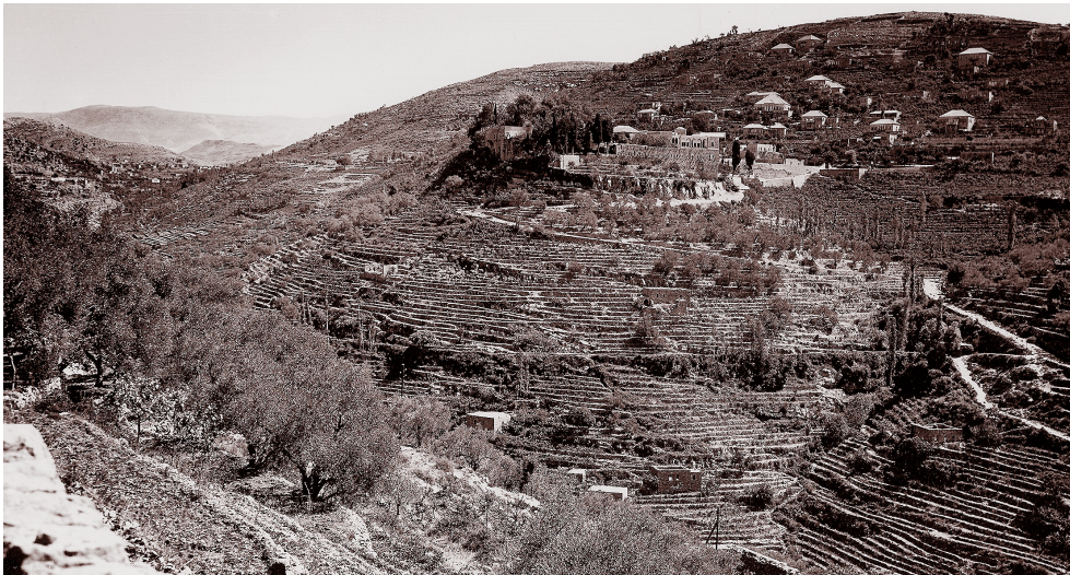
Figure 5. Rock-walled bench terraces in Lebanon that have been in use for thousands of years. The construction of terraces of this type would cost from $2,000 to $5,000 per acre if labor was figured at 40 cents per hour. Such expensive methods of protecting land are practical only where people have no other land on which to raise their food.

Such natural restocking also shows that this famous forest has not disappeared because of adverse change of climate, but that under the present climate it would extend itself if it were safe-guarded against the rapacious goats that graze down every accessible living plant on these mountains.