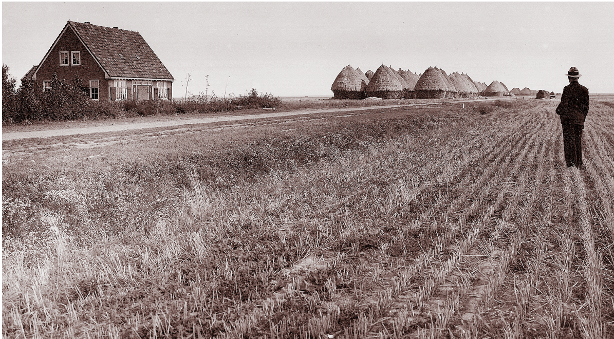
Figure 14. A Dutch farm in the Wieringermeer Polder of the Netherlands. Only 7 years before this picture was taken this land was covered by the North Sea.

The Dutch by this means have created a new agricultural paradise into which only select farmers may enter. Out of 30 applications for each farm, one applicant is selected on the basis of character, the past record of his family, and his freedom from debt. The successful applicant is put on probation for a period of 6 years. If he farms the land in accordance with the best interests of the land and of the country, he will be permitted to continue for another period. If he fails to do so, he must get off and give another farmer applicant a chance.