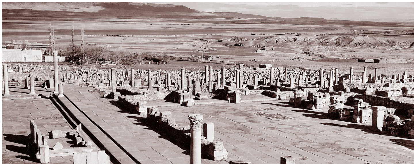
Figure 9. The ruins of Timgad—an ancient Roman city built during the first century A.D. The few huts seen in the center background now house about 300 inhabitants, which is all the eroded land will support. Note that the eroded hills in the background are almost as desolate as the ruins of the city.

Mago was recognized by the Greeks and Romans as the foremost authority on agriculture in the Mediterranean area. These works of Mago on agricultural subjects were translated by such Roman writers as Columella, Varro, and Cato. The translations tell us that the traditions of conserving soil and water discovered on the slopes of ancient Phoenicia had been brought there by colonists. We suspect these measures furnished the basis of the great agricultural production that was so important to the Romans during the Empire.