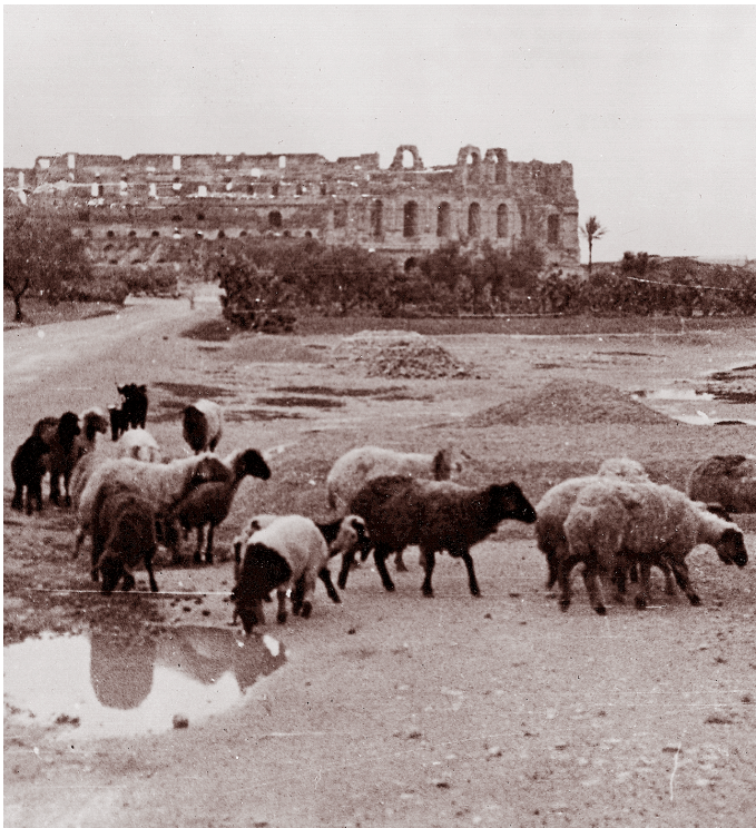
Figure 10. Ruins of the amphitheater at the former city of Thysdrus, in Tunisia, which would seat 60,000 people. Today, only a few thousand people inhabit this area. The small flock of sheep in the foreground are a fair indication of the land's ability to support life.

Over a large part of the ancient granary of Rome we found the soil washed off to bedrock and the hills seriously gullied as a result of overgrazing. Most valley floors are still cultivated but are eroding in great gullies fed by accelerated storm runoff from barren slopes. This is in an area that supported many great cities in Roman times.