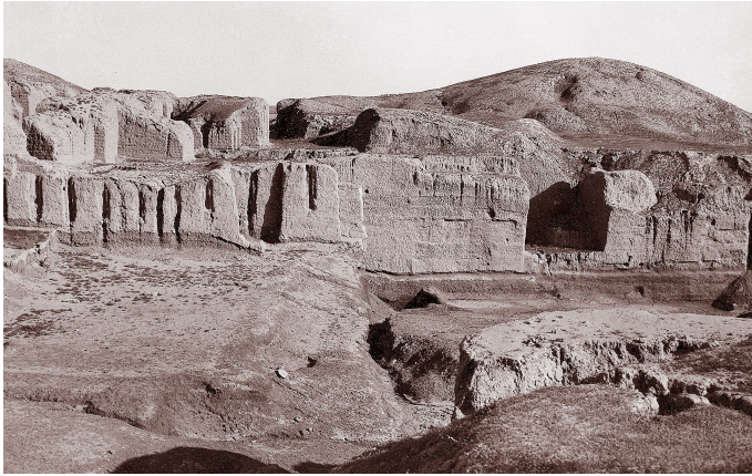
Figure 1. Ruins of Kish, one of the world's most important cities 6,000 years ago. Recently, archaeologists excavated these ruins from beneath the desert sands of Mesopotamia.