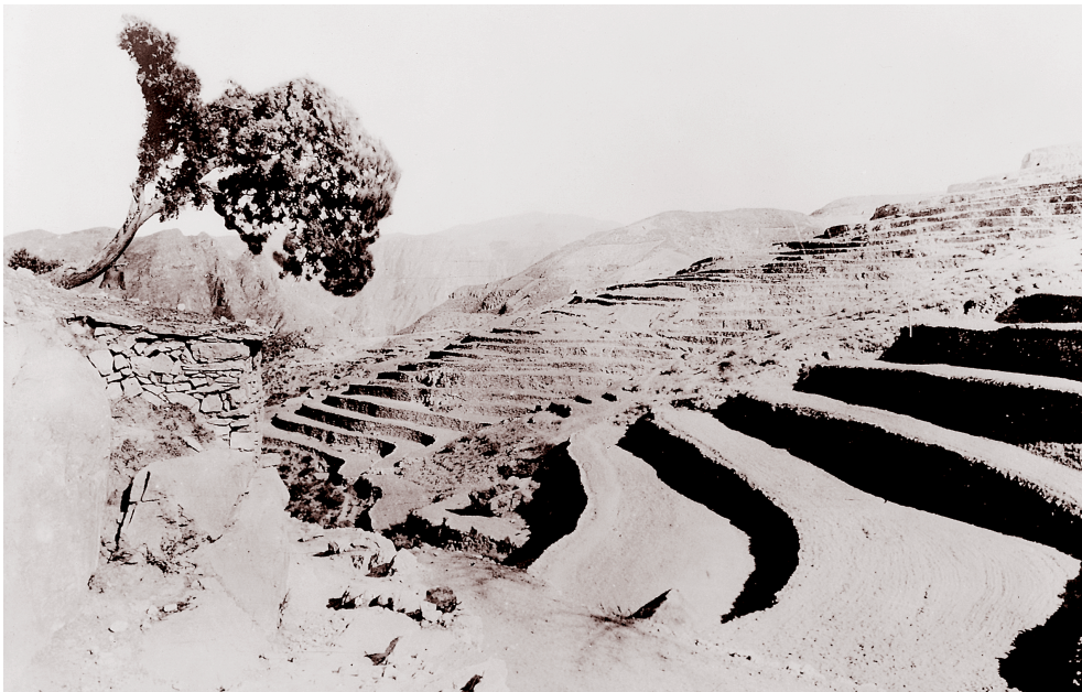
Figure 7. These bench terraces in Shansi Province illustrate the extent to which some Chinese farmers have gone to conserve the remaining soil on their hillsides.

It was in the presence of such tragic scenes on a gigantic scale that I resolved to run down the nature of soil erosion and to devote my lifetime to study of ways to conserve the lands on which mankind depends.