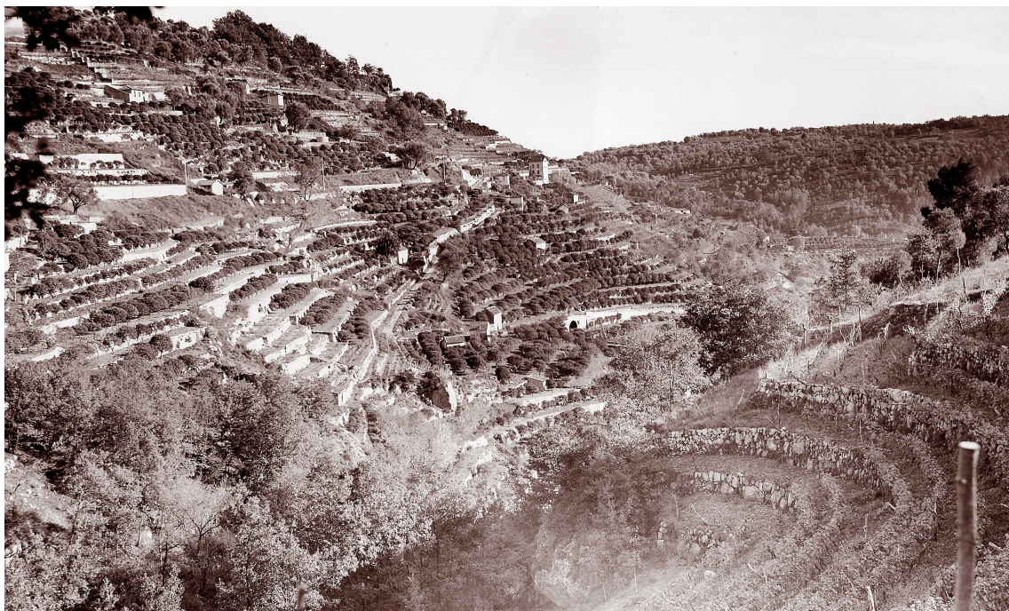
Figure 11. A terraced citrus orchard in southern France. It is believed that terraces of this type were first built in France by the Phoenicians about 2,500 years ago. Modern French farmers are still maintaining and farming such hillsides, however, because of the scarcity of good land.

This excessive use of the mountainous areas in the French Alps unleashed torrential floods that for more than a century ravaged productive Alpine valleys. Erosional debris was swept down by recurring torrential floods to bury fields, orchards, and villages; to cut lines of communication; and to kill inhabitants of the valleys.