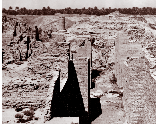
Figure 2. Ruins of the famous stables of Nebuchadnezzar in Babylon built during the sixth century B.C. Babylon died and was buried by the desert sands, not because it was sacked and razed but because the irrigation canals that watered the land that supported the city were permitted to fill with silt.

had been cultivated for a thousand years—the basis of a permanent agriculture. Likewise, we tried to find the reasons why lands formerly cultivated had been wasted or destroyed, as a warning to our farmers and our city folks of a possible similar catastrophe in this new land of America. A simplified method of field study enabled us to examine large areas rapidly.