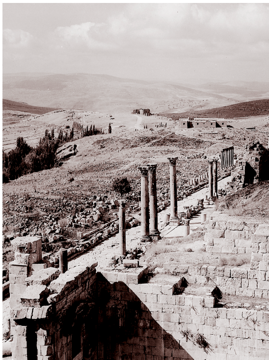
Figure 4. Ruins of one of the Hundred Dead Cities of Syria. From 3 to 6 feet of soil has been washed off most of the hillsides. This city will remain dead because the land around it can no longer support a city.

When we examined the slopes surrounding Jerash we found the soils washed off to bedrock in spite of rock-walled terraces. The soils washed off the slopes had lodged in the valleys. These valleys were cultivated by the seminomads who lived in black goat-hair tents. In Roman times this area supplied grain to Rome and supported thriving communities and rich villas, ruins of which we found in the vicinity.