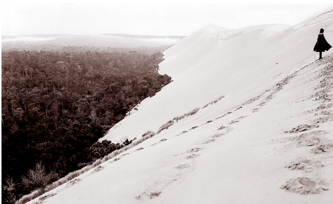
Figure 13. One of the uncontrolled sand dunes in the Les Landes forest of southwestern France. French engineers have, in the past, brought about 400,000 acres of such dunes under control, and the area is again producing timber.

It is recorded that the Vandals in A.D. 407 swept through France and destroyed the settlements of the people who in times past had tapped pine trees of the Les Landes region and supplied resin to Rome. Vandal hordes razed the villages, dispersed the population, and set fire to the forests, destroying the cover of a vast sandy area. Prevailing winds from the west began the movement of sand. In time, moving sand dunes covered an area of more than 400,000 acres that in turn created 2 1/4 million acres of marshland.