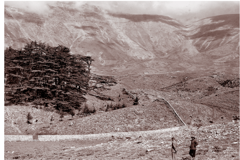
Figure 6. Cedars still grow in Lebanon when given a chance. This is part of one of the four small groves that still exist. It is in the grounds of a monastery and is protected from goat grazing by the stone fence.