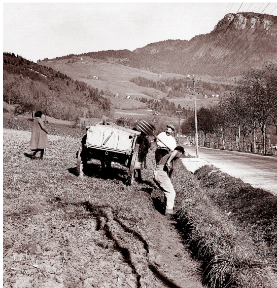
Figure 12. These French farmers are digging up the soil along the lower furrow of their field and loading it into a cart. It will be hauled uphill and spread along the upper edge. They do this job each winter to help compensate for the downhill movement of soil by erosion.