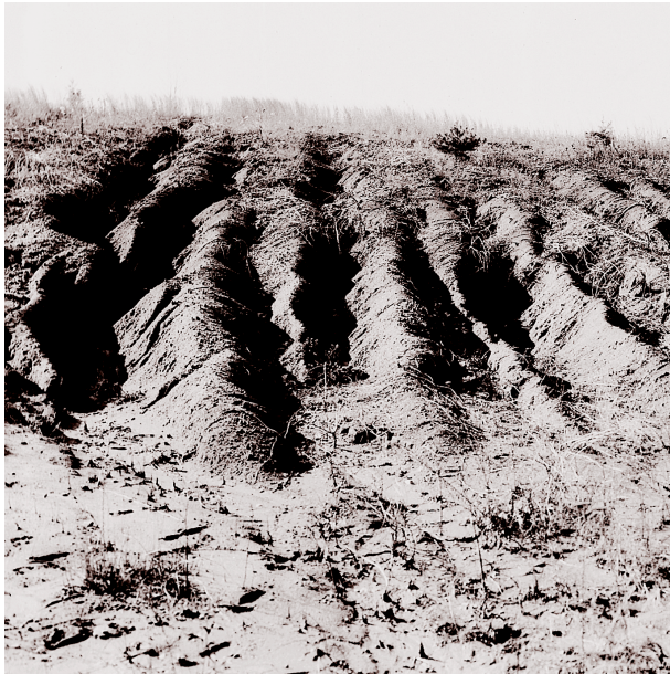
Figure 15. A formerly productive field in Virginia that has been cut to pieces by gully erosion. About 50 million acres of good farm land in the United States have been ruined for further practical conservation by similar types of erosion.