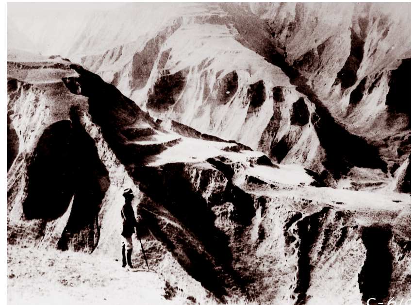
Figure 8. These huge gullies indicate the severity of soil erosion in the deep, and once fertile, loessial soils of northern China. Millions of acres have been cut up like this and are now almost worthless.