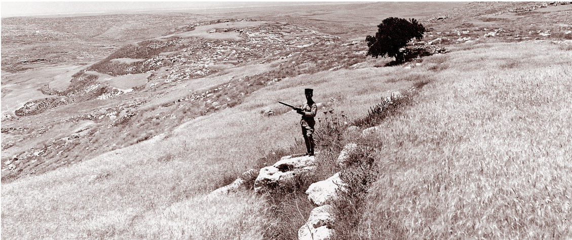
Figure 3. This is a present-day view of a part of the Promised Land to which Moses led the Israelites about 1200 B.C. A few patches still have enough soil to raise a meager crop of barley. But most of the land has lost practically all of its soil, as observed from the rock outcroppings. The crude rock terrace in the foreground helps hold some of the remaining soil in place.

depths that spring out of valleys and hills; a land of wheat and barley and vines and fig trees and pomegranates, a land of olive oil and honey; a land wherein thou shalt eat bread without scarceness; thou shalt not lack anything in it; a land whose stones are iron and out of whose hills thou mayest dig brass.