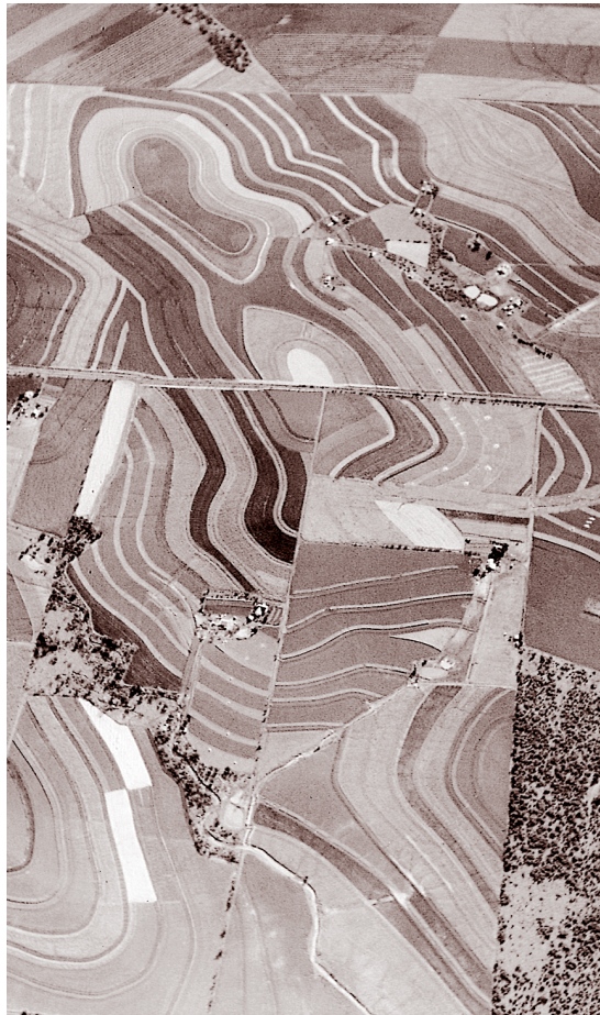
Figure 16. This airplane view shows parts of six different farms near Temple, TX, where the farmers have banded together to combat erosion as a community problem.

he had cultivated for 20 years in a way that has caught the imagination of thoughtful agriculturists of the Nation. We talked about the simple device of forest ground litter and how effective it is in preventing soil erosion even on steep slopes, and how he thought that if litter at the ground surface would work in the forest it ought also to work on his cultivated fields along the same slope.