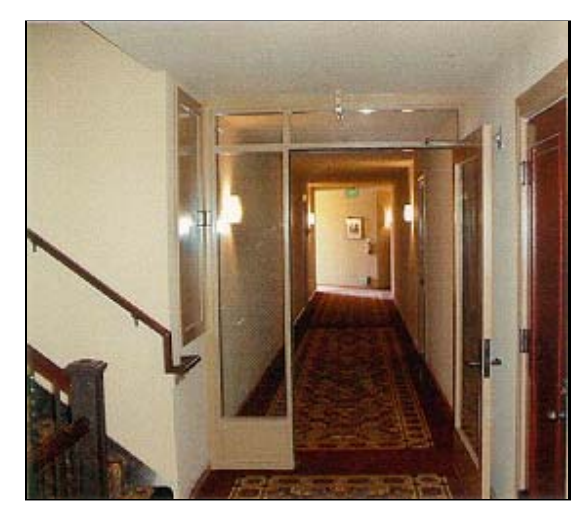
LEFT: Pre-rehabilitation view of typical corridor showing historic trim and deteriorated flat plaster.

RIGHT: Post-rehabilitation view of typical corridor showing retention of historic trim, drywall finishes that match the appearance of the original flat plaster, and a slightly lower ceiling that conceals new systems. Also shown are a compatible, largely glazed fire door and a portion of the preserved open stair (lower left of image).