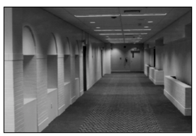
Left: Corridor after rehabilitation. Right: Corridor width and length, as well as features such as the brick wainscot, were retained.