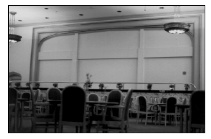
Former auditorium before rehabilitation as the dining room.

The rectangular auditorium featured tall, tripartite windows, glazed brick wainscotting, and intact proscenium arch, brass light fixtures, and a sloping floor. All these features were retained when the space was converted into a dining room, with a new level floor. A new partition was added immediately behind the proscenium for a new kitchen. The gymnasium, unlike the auditorium, was utilitarian in appearance and function, without distinguishing features or finishes. For this reason, in addition to the fact that the auditorium space was being preserved, the gymnasium was determined to be expendable, and the space divided into two-level apartments. Other interior features such as built-in wood benches, built-in cabinets and the kindergarten fireplace, were also preserved. In addition, features associated with the school's site were preserved in the rehabilitation project, providing residents with such amenities as an outdoor picnic area, benches, and courtyards. The adaptive use project successfully preserved the school's distinctive spaces, features, finishes, and site, while less distinctive elements were modified or removed.