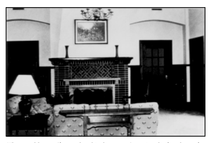
The new library (formerly a kindergarten) retains the fireplace after rehabilitation.