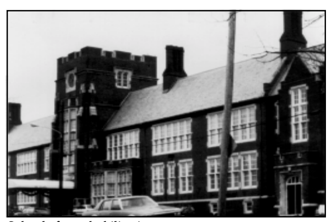
School after rehabilitation.

Spaces, such as classrooms, auditoriums, hallways, lunchrooms, and libraries; features and finishes, such as wainscoting, transoms over doors, marble floors, and blackboards; and site features, such as playgrounds, walkways, and lawns are elements that often characterize a historic school building. In other cases, the sequence of spaces - the relationship of classrooms to corridors and stairs, for example - or the generous floor-to-ceiling heights and room sizes may contribute to the school's historic character. Identification