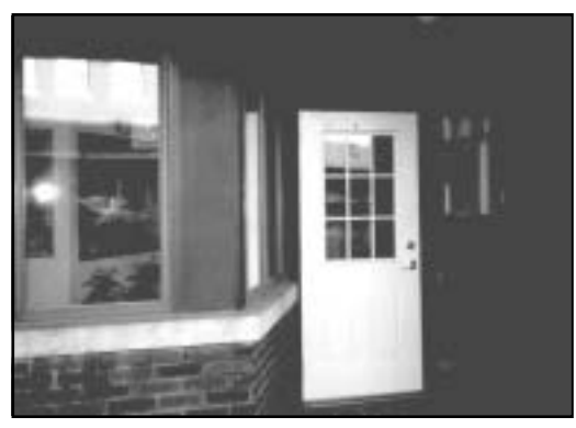
Incompatible "stock" door.

The storefront windows were replaced with simple, contemporary windows with dark-colored frames that were compatible with the historic building. But the "stock" white entrance door with its nine-pane glass and snap-in muntins above two vertical panels was not compatible with the historic building. In order to bring the project into compliance with the Standards, remedial work involved replacing the stock door with a simple glazed wood door that was compatible in both design and color with the historic building.