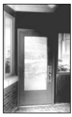
Appropriate replacement door.

The storefront windows were replaced with simple, contemporary windows with dark-colored frames that were compatible with the historic building. But the "stock" white entrance door with its nine-pane glass and snap-in muntins above two vertical panels was not compatible with the historic building. In order to bring the project into compliance with the Standards, remedial work involved replacing the stock door with a simple glazed wood door that was compatible in both design and color with the historic building.