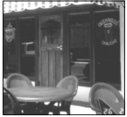
Rehabilitated storefront with incompatible stained glass door.

Application 3 ( Incompatible treatment ): In a third project, a two and one-half story Foursquare house with Colonial Revival-style details built in the first decade of the 20th century was rehabilitated for continued residential use. Although most of the interior finishes and features, including all lath and plaster, had been removed by a previous owner, the original front door still remained. In the course of the rehabilitation, however, this historic door was replaced with a new door featuring multi-paned glass with two vertical panels below, the same "stock" door, in fact, that was used in the dairy conversion project. This multi-paned door is no more compatible with the character of this early-20th century house, than it was with the 1920s dairy building. To meet the Standards, the