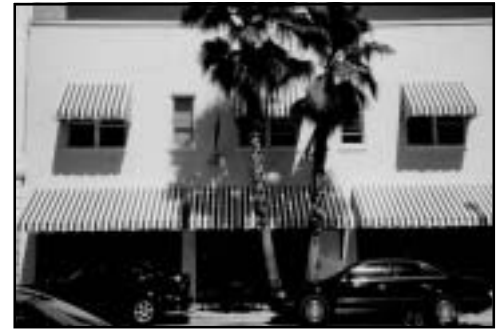
Rehabilitated 1920s commerical building.

Application 2 ( Incompatible treatment , later corrected to meet the Standards ): Another two-story vernacular masonry commercial building, also dating from the 1920s, that features three, one-bay storefronts on the first floor was rehabilitated for continued use as a restaurant and bar with rental apartments on the second floor. The original, historic storefronts had been replaced in the 1950s with aluminum frame windows and doors. Although, the Standards would also have allowed these later storefronts to be retained in the rehabilitation, the owner chose to install a new wood storefront with a simple, contemporary design, compatible with the building's historic character. However, the replacement wood doors had