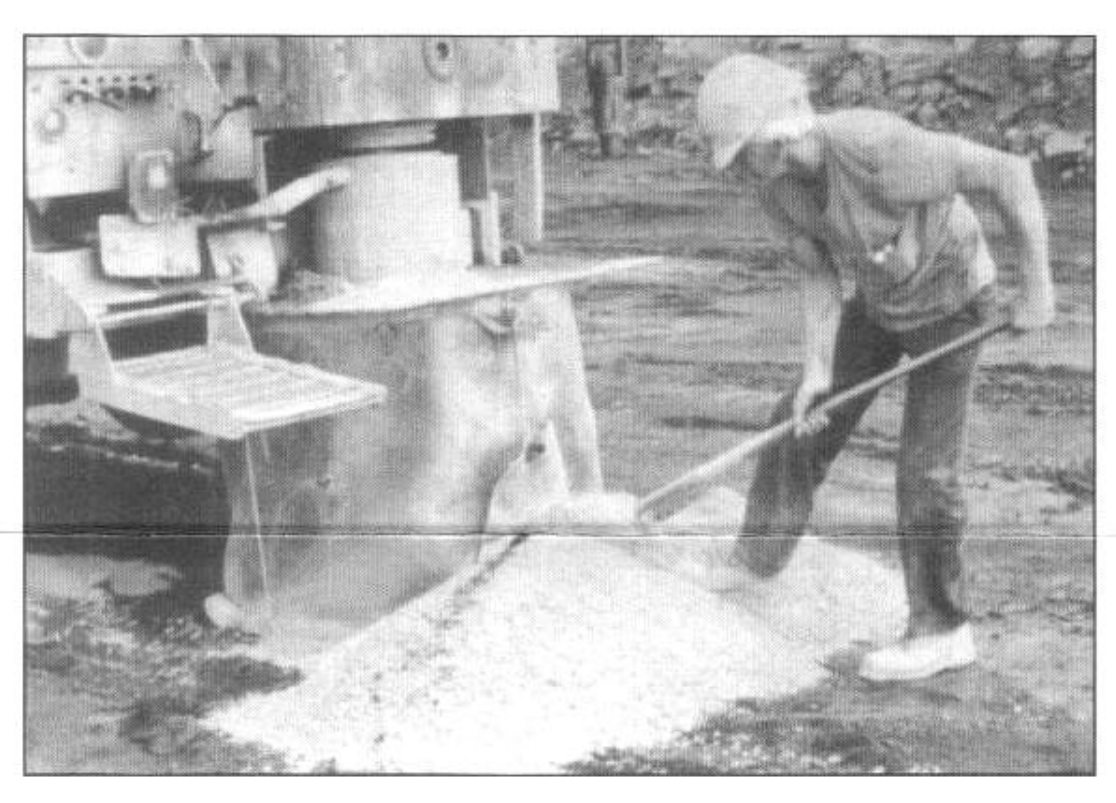
Figure 1. Dry dust collection system for blast hole drill: circular deck shroud.