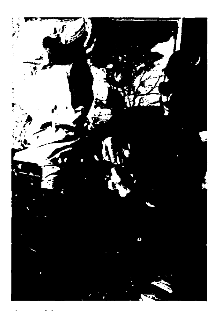
As part of donning operations, an assistant tape seals boots to protective clothing to eliminate routes of entry for chemicals.

Once the equipment has been donned, its fit should be evaluated. If the clothing is too small, it will restrict movement, thereby increasing the likelihood of tearing the suit material and accelerating worker fatigue. If the clothing is too large, the possibility of snagging the material is increased, and the dexterity and coordination of the worker may be compromised. In either case, the worker should be recalled and better fitting clothing provided.