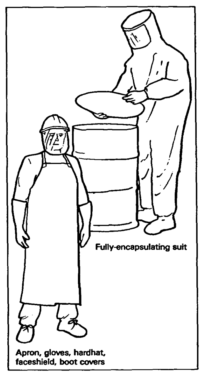
Figure 8-3. Examples of Protective Clothing.

Selection of chemical-protective clothing is a complex task and should be performed by personnel with training and experience. Under all conditions, clothing is selected by evaluating the performance characteristics of the clothing against the requirements and limitations of the site- and task-specific conditions. If possible, representative garments should be inspected before purchase and their use and performance discussed with someone who has experience with the clothing under consideration. In all cases, the employer is responsible for ensuring that the personal protective clothing (and all PPE) necessary to