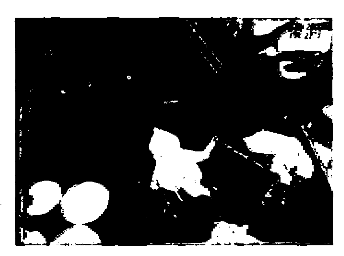
As part of site characterization, workers suited in Level A protective ensembles work in pairs when investigating confined spaces.

explosive atmospheres, oxygen deficiency, toxic substances). Chapter 7 provides detailed information on air monitoring.