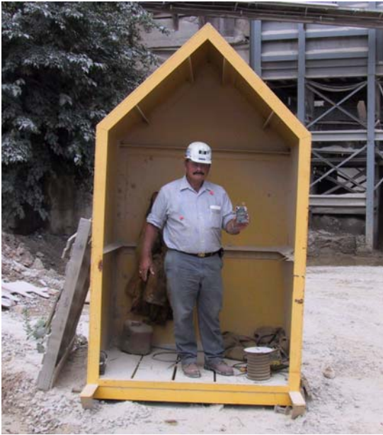
Figure 2. Blasting shelter used at a surface limestone mine in Southwestern USA