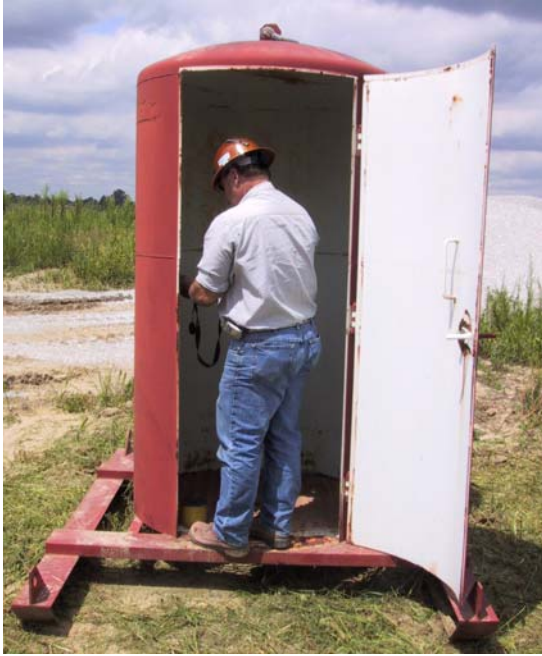
Figure 3. Blasting shelter at a surface limestone mine in Ohio