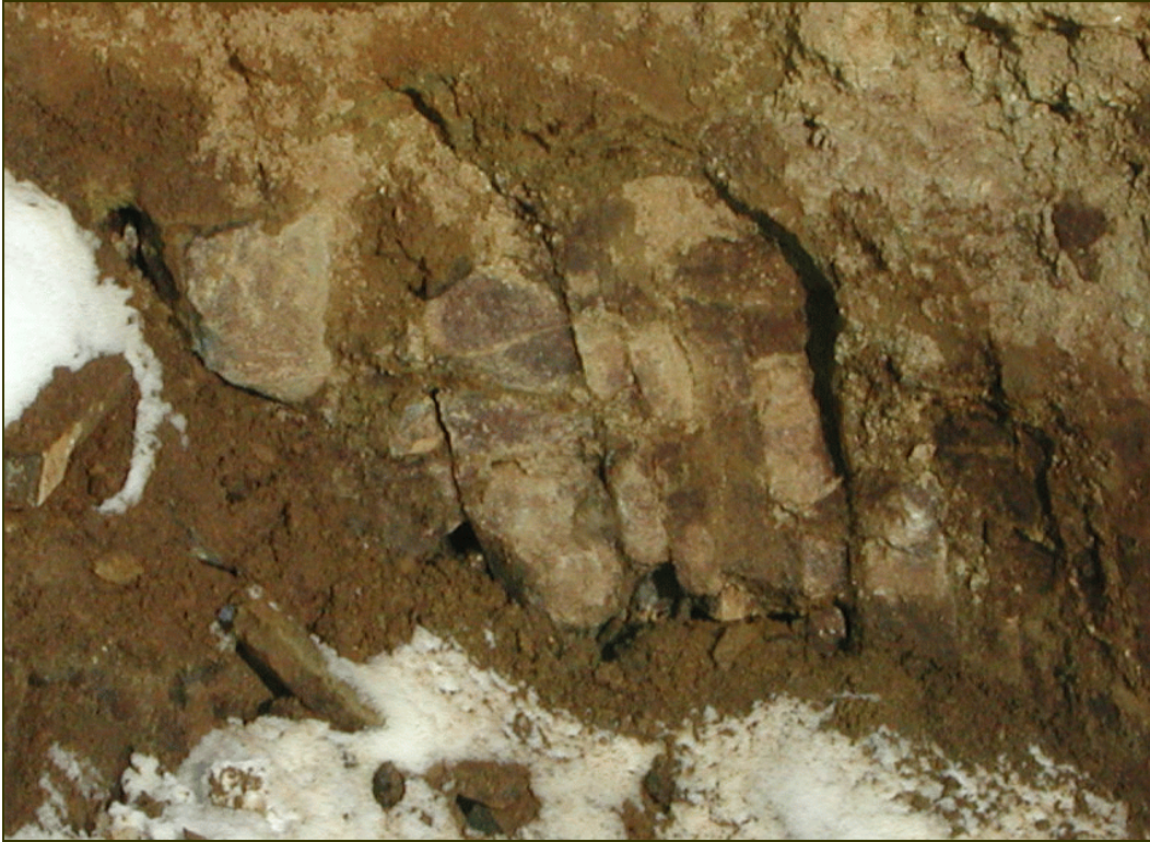
Figure 3 - A close-up of the bedrock seen in Fig. 2. Note the fractures are oriented towards nearby homes.