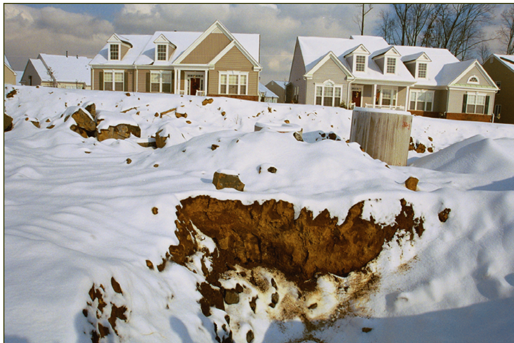
Figure 2 - The first of four pits dug at the location of the trench blast in an effort to vent CO. Homes 1 and 2 can be seen in the background.