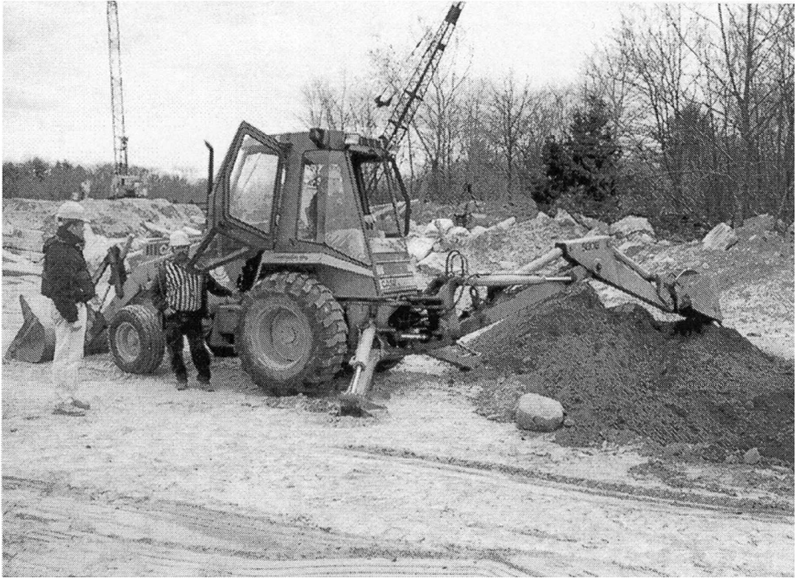
FIGURE 1 A Case Super 580E Backhoe/Loader.