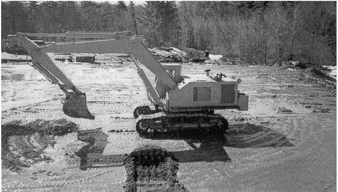
FIGURE 2 An Insley H-2000 Excavator.