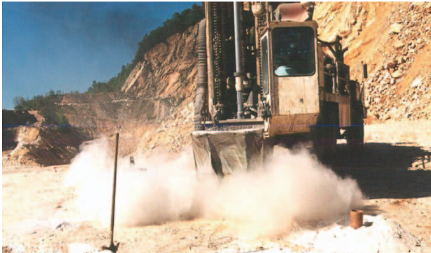
Figure 1: By measuring and monitoring leakage, mine operators can set benchmarks for reducing dust.