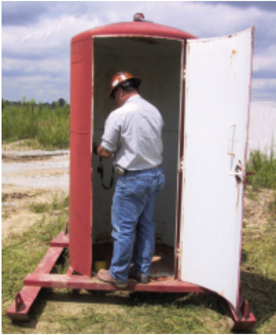
Figure 3. Blasting shelter at a surface limestone mine in Ohio.

Light buildings, pickup trucks, and other vehicles which are often used as covers, have been penetrated by flyrock [Schneider, 1996]. During a coal mine blast, a blaster positioned himself under a Ford 9000, 21/2-ton truck, and fired the shot. A piece of flyrock traveled about 750 ft and fatally injured the blaster under the truck [MSHA, 1992]. This accident could have been prevented by using an adequate blasting shelter. A safe location and sufficient cover is critical to a blaster's protection if the firing lines are not long enough to be beyond the flyrock range [Schneider, 1996]. Some blasting operations use a remote controlled firing system to permit blasters to stay out of the blast area.