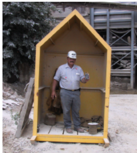
Figure 2. Blasting shelter used at a surface limestone mine in southwestern United States.

Figure 2 shows a blasting shelter used at a surface limestone mine in Southwestern USA. The shelter was constructed by the mine’s personnel. Another example of a blasting shelter used at a surface limestone mine in Ohio is shown in Figure 3 . The mining company requires that this type of blasting shelter be used for protection from a blast. The blast shelter is mounted on skids for ease of transportation and is constructed of steel that is 3/8-inch thick. The use of specially designed blasting shelters can provide the protection needed to prevent a person from being struck by flyrock. In the international sphere, a more sophisticated blast shelter has been designed by two Queensland, Australian inventors [Queensland Government Mining Journal, May 2001]. The shelter, which is cylindrical and constructed of 5/8-inch thick steel, is mounted on a rubber tired trailer.