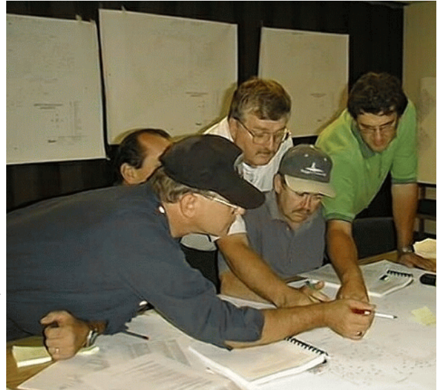
Figure 4 Interactive Mine Emergency Command Center Training

own unique ways in which they learn. Caudron (2000) discusses the importance of designing training materials around the ways adults learn. She points out that the best learning experiences occur through personal experience, group support, and mentoring. The context of the learning is important as most adult learners want to know how what they learn will apply in the workplace. Learning by experience is important since adults learn best by having experiences and reflecting on them, or by reflecting on past experiences. Group experiences are also important ( Figure 4 ). Learners can help each other understand the learning event and learn from each other. According to Caudron, there are several important concepts adult trainers should practice. She encourages the use of collaborative interaction; an atmosphere where learners and instructors support each other in the process both in and out of formal learning; and the use and encouragement of cooperative communication. She also suggests trainers remember that peoples' feelings are critical in developing relationships in any learning situation.