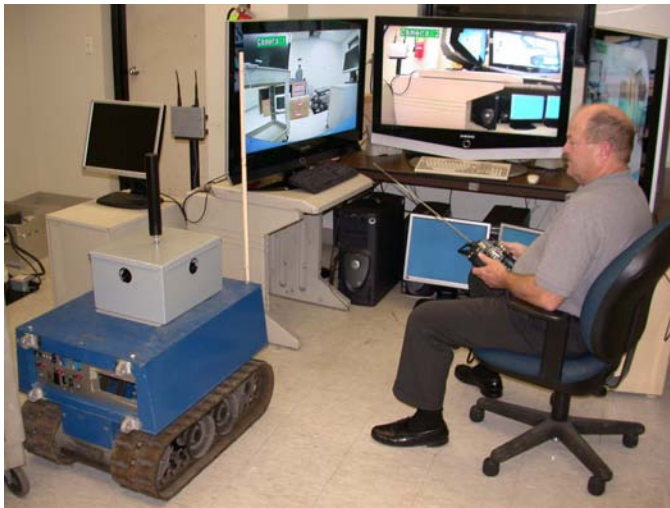
Figure 10. Lab analog video camera tests.