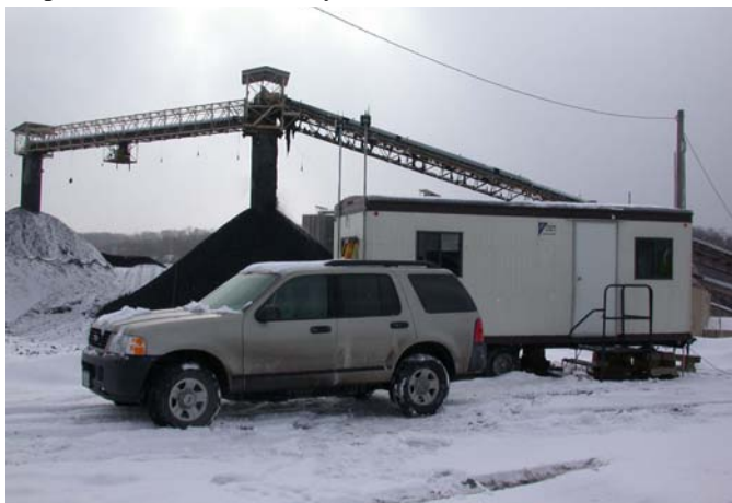
Figure 2. Consol Energy test site.

Ultra system, remote diagnostics, and automatic braking. Further details are available at their web site ( http://www.cat.com/cda/layout?m=71342&x=7 ).