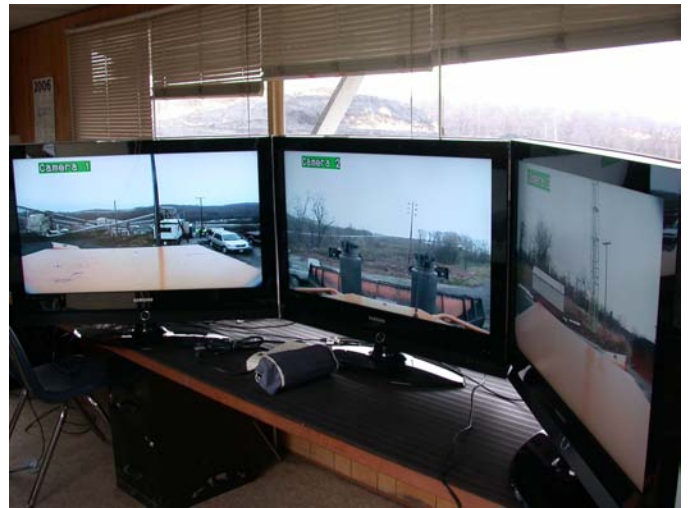
Figure 12. Analog video camera field tests.