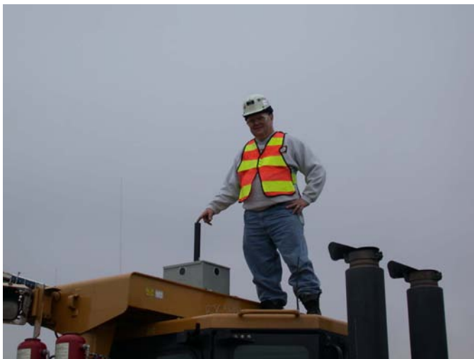
Figure 11. Analog video camera box on dozer cab.

The AVS was taken to the Eighty Four Mine coal stockpile for further tests. The camera housing was placed on top of a non-remote-controlled D10R dozer (Fig. 11). The four LCD monitors and other equipment were installed in the field trailer (Fig. 12). The operator of the dozer was instructed to take the dozer around the entire periphery of the coal stockpile, through normal production areas as well as behind the stacker tubes. The video viewed in the field trailer was excellent. The whole stockpile could be covered with no loss or degradation to the video quality. A little noise in the video was noticed when the dozer went behind the stacker tubes. Since the system was not tested with a remote controlled dozer it is difficult to conclude the effectiveness or efficiency of a remote operator using the camera system. Future testing on a remote-controlled dozer is required. The audio system was not tested. The project concluded with these AVS field tests.