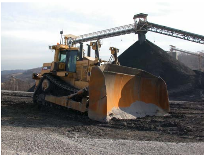
Figure 3. Caterpillar D10T dozer.