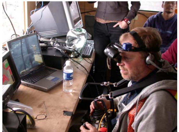
Figure 6. Goggles with head tracker.