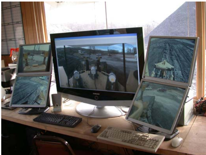
Figure 7. Digital video outputs at trailer.

A compact NIOSH-developed, battery-operated, radio-controlled, tracked, robotic vehicle (called a Multi-Purpose Tele-operated Tracked vehicle (MUTT)), was acquired from a previous NIOSH project for the purpose of testing the dozer video system. The camera housing of the AVS system was installed on the MUTT (Fig. 9). The receiver, demodulator, and four LCD monitors were placed in a small room. With very little training the operator could maneuver the MUTT solely via viewing the images on the LCD monitors (Fig. 10). The system was tested inside an unlit building, outside under heavy cloud cover, and outside during a bright sunny day. There were no perceptible latencies even when the MUTT was operated at full speed.