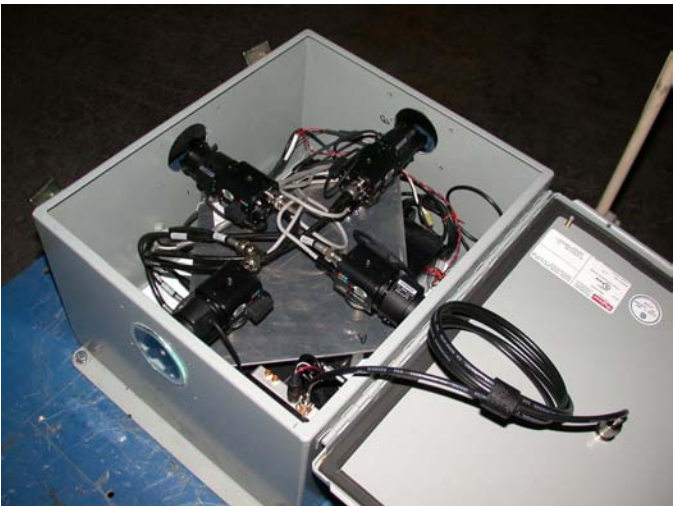
Figure 8. Analog video camera box.

The basic requirement for the analog video system (AVS) was to provide a wireless, real-time, 360-degree image from the dozer. No vendor could be found to supply a system with all these characteristics as one product. However one vendor (DTC http://www.dtccom.com/ ) was found that could provide the wireless transmission system for four simultaneous video channels. The vendor could also supply a variety of cameras with different lenses. NIOSH specified wide-angle lenses that, when combined, would capture a 360-degree image. NIOSH obtained the technology and packaged the cameras in a rugged compact enclosure. The contents of the enclosure were; four cameras, four wide-angle lenses, a four-channel multiplexer, an analog transmitter, an antenna, and a battery (Fig. 8). The operator end of the system consisted of two antennas, a dual-diversity receiver, a four-channel de-multiplexer, and four 40-inch LCD monitors. The LCD monitors were arranged in a circle, with a chair in the center for the operator. Video quality was acceptable, and there was no perceptible image latency. This hardware did provide remote monaural audio from one microphone.