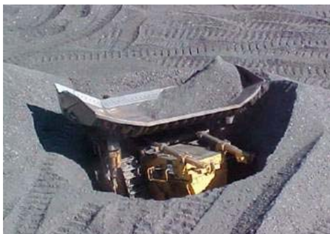
Figure 1. Dozer cover-up on coal stockpile.

Disclaimer 2: Mention of any company or product does not constitute endorsement by the National Institute for Occupational Safety and Health (NIOSH). In addition, citations to Web sites external to NIOSH do not constitute NIOSH endorsement of the sponsoring organizations or their programs or products. Furthermore, NIOSH is not responsible for the content of these Web sites.