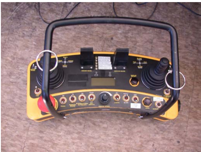
Figure 4. Dozer remote control.

The intended outcome of this NIOSH research was to improve the safety of the operators of bulldozers on coal stockpiles by investigating the feasibility of sensor-enhanced remote control. The research project was conducted to answer the following: