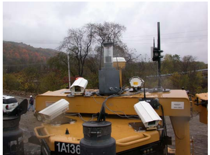
Figure 5. Digital cameras on dozer cab.

The decision was made to add more fixed cameras to the dozer because one camera was installed to view the left side of the dozer blade and tracks, a second to view the right side of