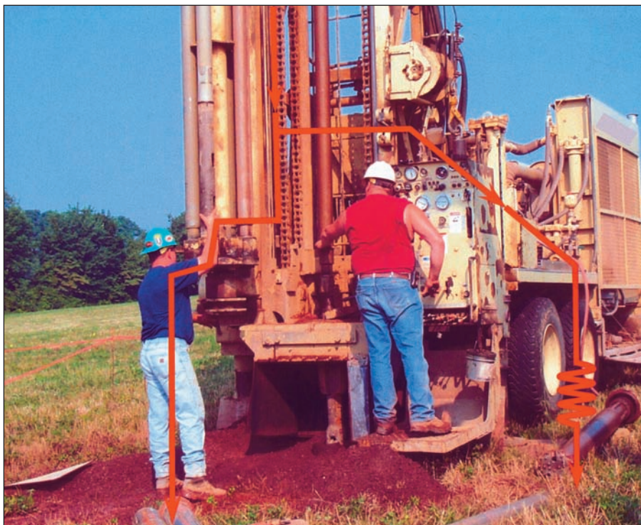
Figure 2. This photo shows possible electrical current paths to ground through a drill rig and a driller's helper during an overhead power line contact accident. This helper would probably be seriously injured or killed.