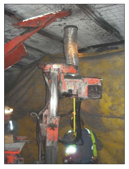
Figure 3.—As drilling advances, the CDSE collapses.

<u>JPeterson@cdc.gov</u>) or Lynn A. Alcorn (412-386-6732, <u>LAlcorn@cdc.gov</u>), NIOSH Pittsburgh Research Laboratory, P.O. Box 18070, Pittsburgh, PA 15236-0070.