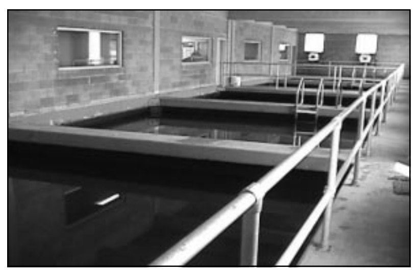
Many water treatment plants filter their water.

While filtration was a fairly effective treatment method for reducing turbidity, it was disinfectants like chlorine that played the largest role in reducing the number of waterborne disease outbreaks in the early 1900s. In 1908, chlorine was used for the first time as a primary disinfectant of drinking water in Jersey City, New Jersey. The use of other disinfectants such as ozone also began in Europe around this time, but were not employed in the U.S. until several decades later.