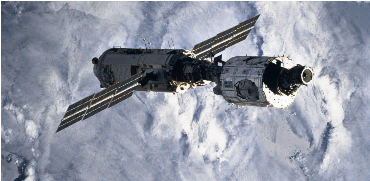
Figure 2: Zarya and Unity in Orbit