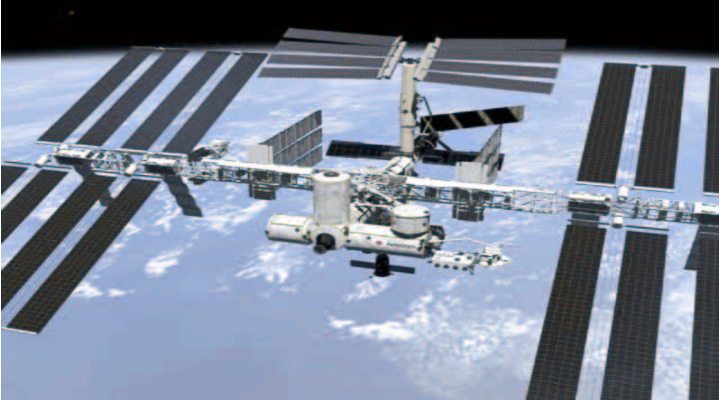
Figure 1: Artist's Conception of Fully Assembled ISS in Orbit