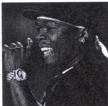
Candy Shop by 50 Cent was the No. 1 downloaded ringtone last year at 1.9 million sales.

Chris Brown's Run It! , the Black Eyed Peas' My Humps and Young Jeezy's Trap Star are alerting cellphone users to incoming calls, but the sound ringing in the ears of the music business is "ka-ching."