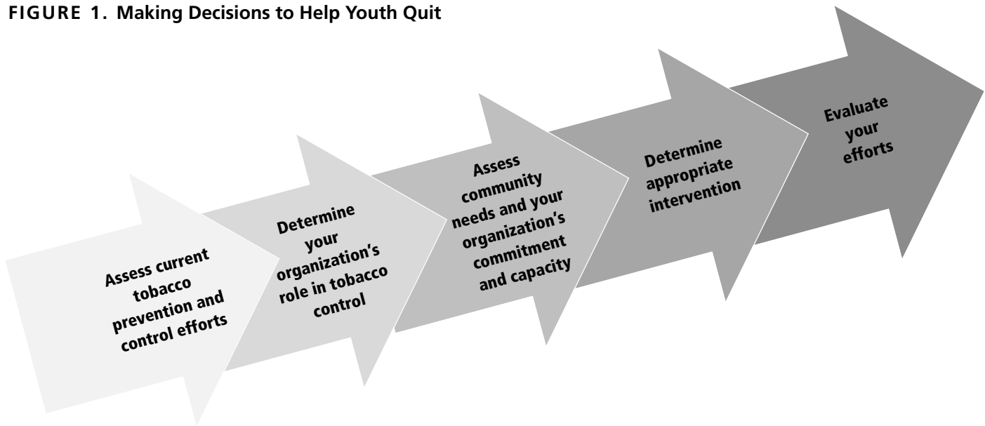
FIGURE 1. Making Decisions to Help Youth Quit

Chapter 2 outlines important issues that should be considered when deciding whether to establish a youth tobacco-use cessation intervention. It describes the tasks that should be undertaken as part of the planning process, such as conducting needs assessments, engaging stakeholders, and evaluating outcomes.