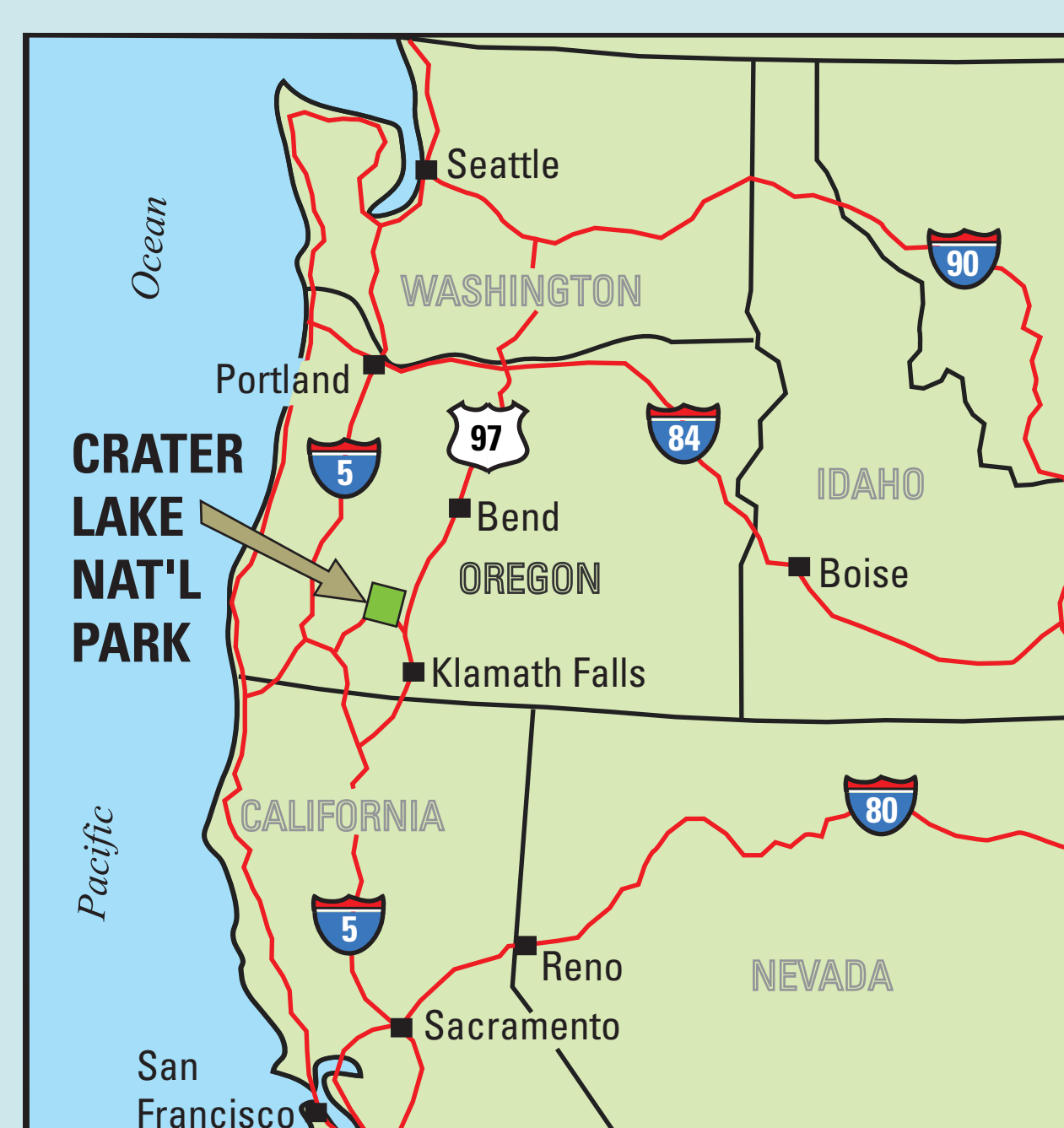
Location of Crater Lake National Park

Scientists will use the new map to study Crater Lake's biology, chemistry, geology, and other areas of interest. The new map is much more accurate than the last map made in 1959. The NPS will use this map to help preserve Crater Lake, and to help you enjoy the park on your next visit.