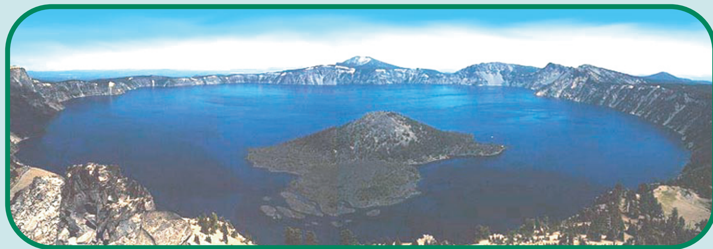
Air photo of Crater Lake

The USGS mapped Crater Lake, Oregon using sonar, in cooperation with the National Park Service (NPS), the University of New Hampshire (UNH), and C&C Technologies (C&C).