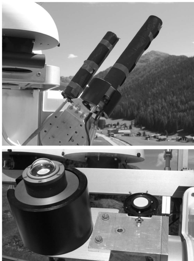
Fig. 1. Direct solar measurement setup with the two entrance optics mounted on the solar tracker. The upper part shows the entrance optics pointed toward the sun with the mounted shading tubes. In the lower part, the shading tubes have been removed and the diffusers can be seen.

The measurements were obtained close to solar noon with a solar zenith angle of about 35°. Five solar spectra in the range 300 to 390 nm were obtained during the measurement period of 50 min. The fifth spectrum was discarded from the analysis because of clouds moving close to the solar disk and entering the