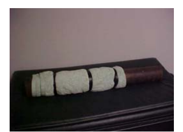
3.1.14. Forty-five pound pipe weight or equivalent.