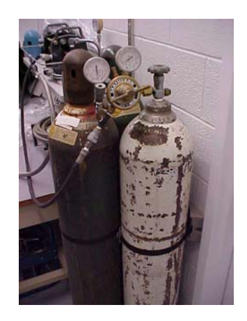
3.1.10. Oxygen - U.S.P or equivalent.