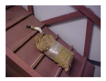
3.1.13. Fifty-pound sack or equivalent.