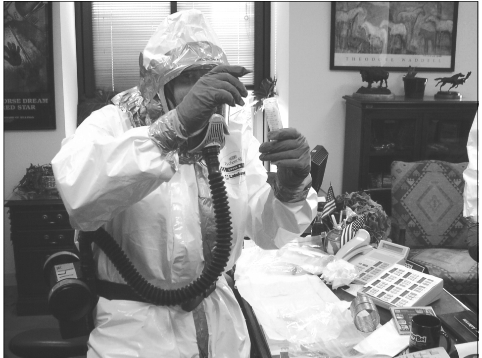
Figure 1: A Sample Is Inserted into a Vial in the Hart Senate Office Building