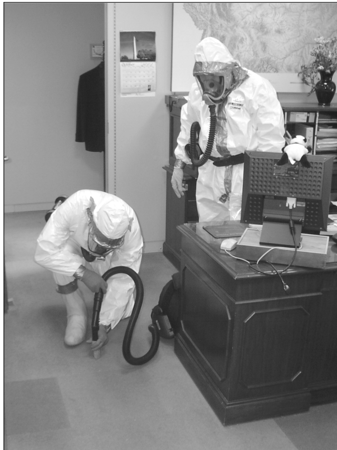
Figure 2: Cleanup Personnel Use a HEPA Vacuum in a Congressional Office