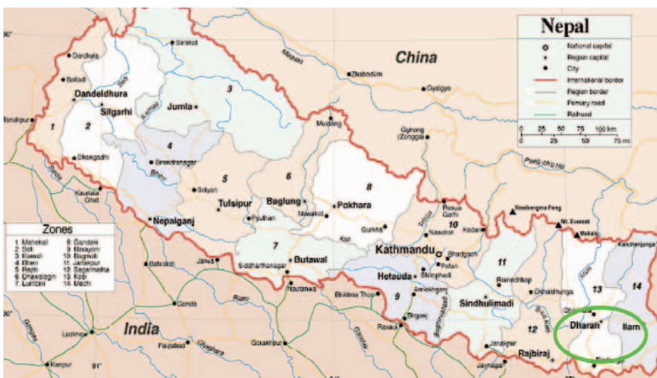
Figure 1. Early outbreak of influenza A (H3N2) in southeastern Nepal. The green circle shows the location of 3 Bhutan refugee camps where the outbreak occurred in early July 2004.

HI was performed by using postinfection ferret antisera with reference antigens that included the 2004–2005 H3N2 vaccine seed strain (A/Wyoming/03/2003) and the 2005–2006 Southern Hemisphere H3N2 vaccine strain (A/Wellington/1/2004). When compared with A/Wyoming/03/2003, 4 of 9 Nepal isolates showed 4-fold lower titers (1:320 versus 1:1,280 HI units) than that allowed for homologous titer of the reference antisera. This indicated that these 4 isolates were antigenically distinct. Six of 9 Nepal isolates were antigenically distinct