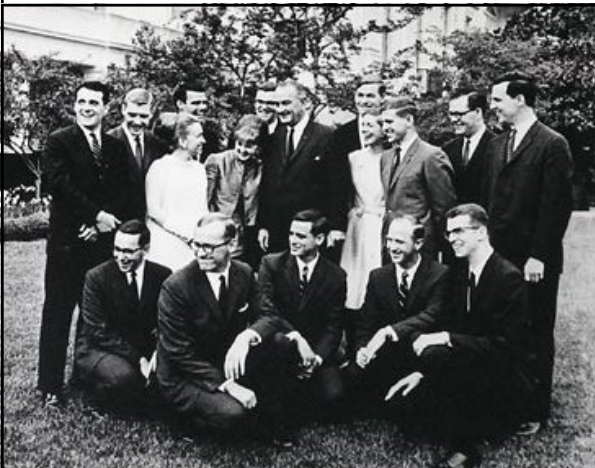
1967-1968 White House Fellows with President Johnson