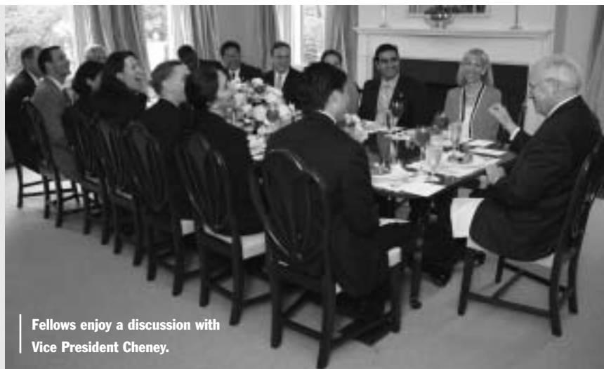
Fellows enjoy a discussion with Vice President Cheney.