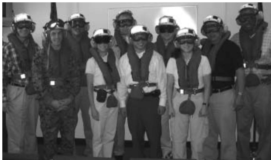
The 2003-2004 Class of White House Fellows visit the aircraft carrier USS Harry S. Truman during a military policy study trip.