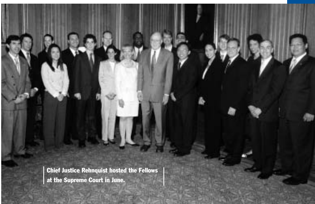
Chief Justice Rehnquist hosted the Fellows at the Supreme Court in June.