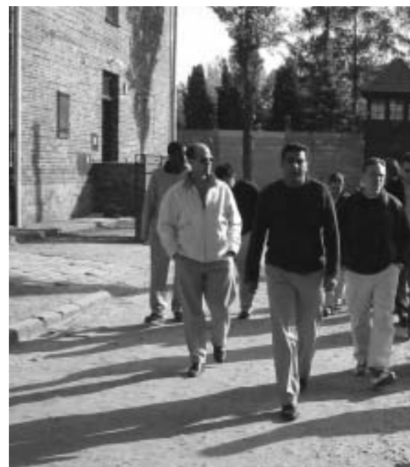
A somber mood prevails following the Fellows' visit to Auschwitz

— Article contributed by Eileen Stephens