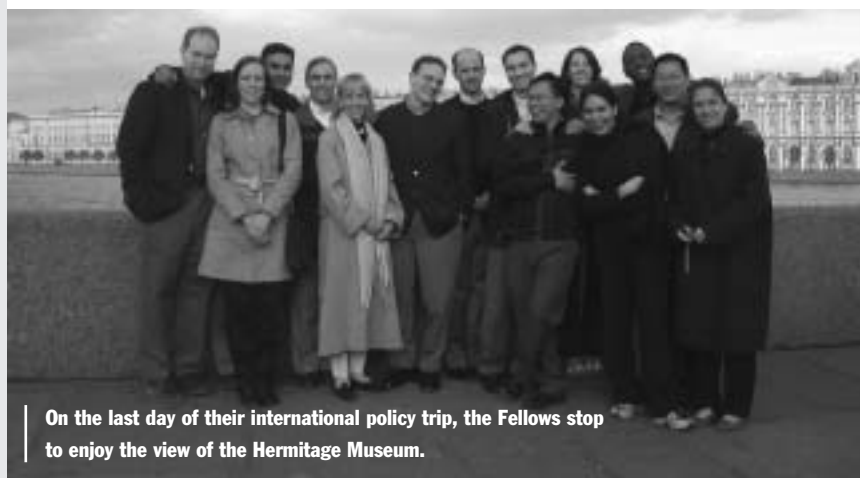
On the last day of their international policy trip, the Fellows stop to enjoy the view of the Hermitage Museum.