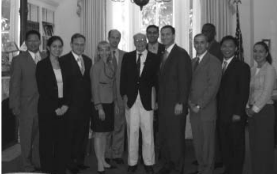
Former Secretary of Defense Robert McNamara and the Fellows pose following a Speaker Seminar.