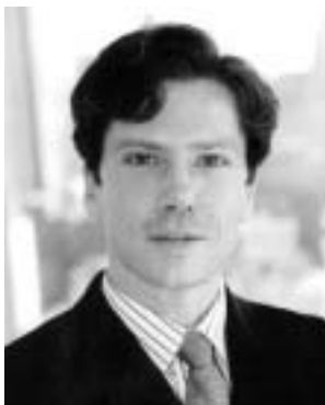
Louis O'Neill Department of State