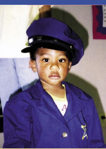
The mixed-approach programs consistently enhanced children's language development and aspects of social-emotional development.

Early Head Start programs must adhere to the Head Start Program Performance Standards. In the implementation study phase of the evaluation (reported in two reports, Pathways to Quality and Leading the Way), programs were systematically rated on the extent to which they implemented the performance standards. Early Head Start programs that implemented the standards early (by 1997 site visits) or later (by 1999) demonstrated a broader pattern of significant impacts than was true for the several programs that were not rated as fully implemented in 1999. This finding underscores the importance of adherence to the performance standards for producing a breadth of impacts for children and parents.