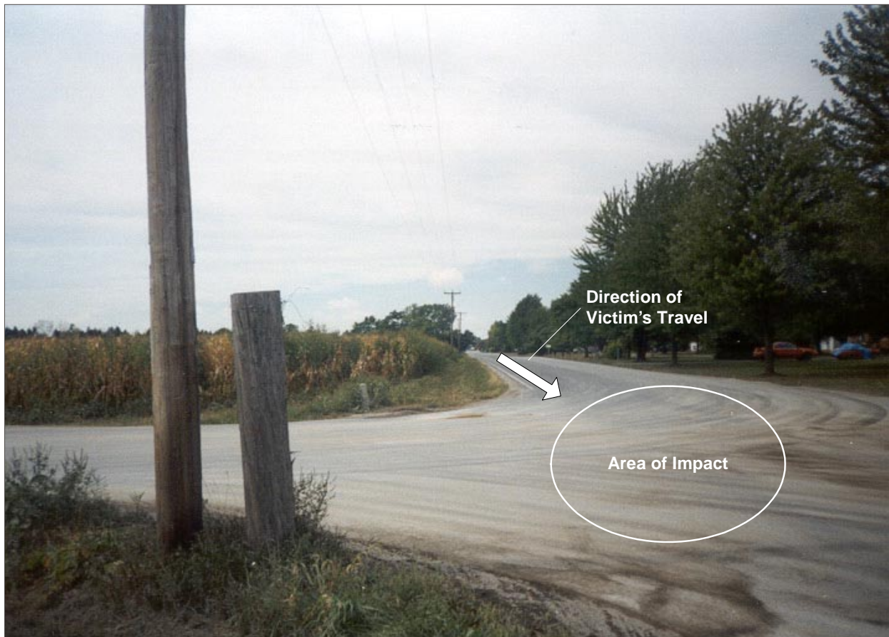
Figure 1. Incident Site: Intersection