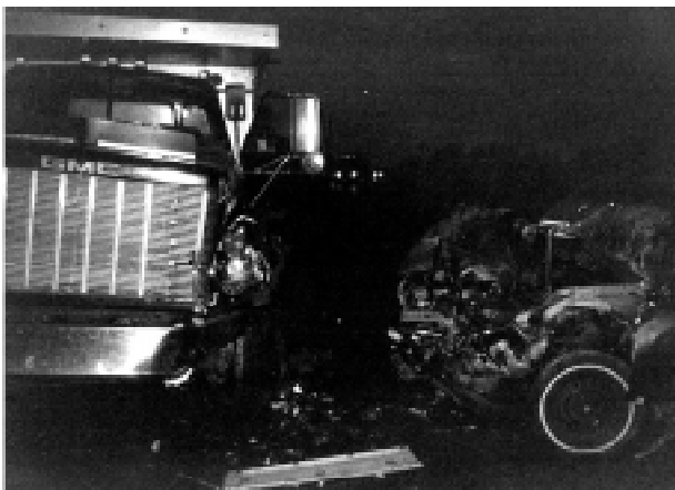
Vehicles Involved in Incident

The Fire Fighter Fatality Investigation and Prevention Program is conducted by the National Institute for Occupational Safety and Health (NIOSH). The purpose of the program is to determine factors that cause or contribute to fire fighter deaths suffered in the line of duty. Identification of causal and contributing factors enable researchers and safety specialists to develop strategies for preventing future similar incidents. To request additional copies of this report (specify the case number shown in the shield above), other fatality investigation reports, or further information, visit the Program Website at: