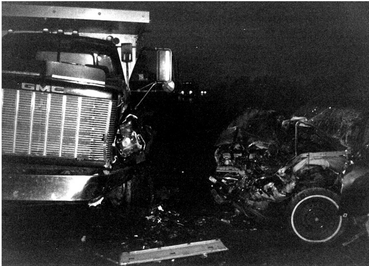
Figure 2. Vehicles Involved