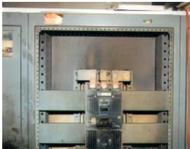
Emergency Power Breaker

The Fire Fighter Fatality Investigation and Prevention Program is conducted by the National Institute for Occupational Safety and Health (NIOSH). The purpose of the program is to determine factors that cause or contribute to fire fighter deaths suffered in the line of duty. Identification of causal and contributing factors enable researchers and safety specialists to develop strategies for preventing future similar incidents. The program does not seek to determine fault or place blame on fire departments or individual fire fighters. To request additional copies of this report (specify the case number shown in the shield above), other fatality investigation reports, or further information, visit the Program Website at