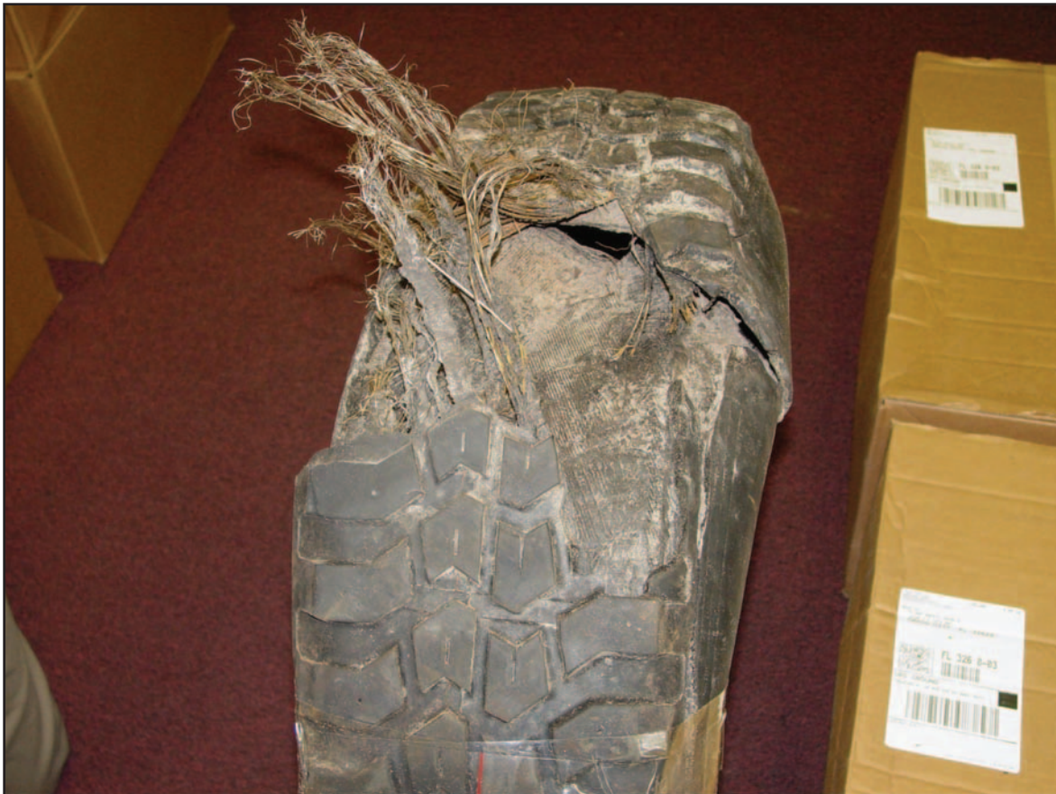
Photo. Right front tire after blow-out