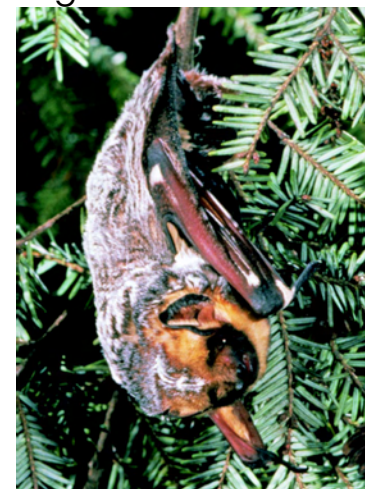
A hoary bat