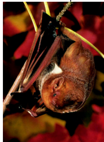
A male red bat