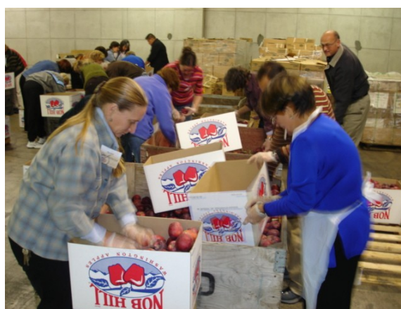
Volunteers pack apples for a Yakima, Washington, food bank.

Formed in 2002, the Access to Healthy Foods Coalition is a statewide group that works to improve the availability of healthful foods for all Washington residents. Members include representatives of business, industry, agriculture, public health, and a variety of other areas. The coalition focuses its efforts on three environments: worksites, point-of-purchase areas (e.g., restaurants and vending machines), and food-assistance programs (e.g., food banks).