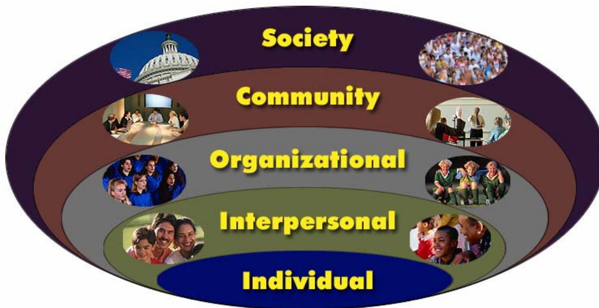
Figure 1. Social-Ecological Model Used by States and Partners to Develop Interventions

Interventions based on the Social-Ecological Model can: