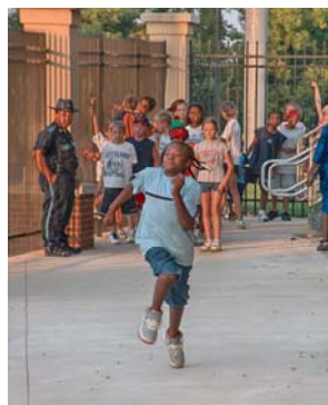
Children participate in a VERB Summer Scorecard event in Lexington, Kentucky.

In Lexington, Kentucky, the local Tweens Nutrition and Fitness Coalition, led by the Lexington-Fayette County Health Department, used elements of CDC's national VERB media campaign to create the VERB Summer Scorecard. This community-based prevention marketing program works with businesses, faith-based groups, and public organizations to encourage physical activity among children ages 9-13 through free or reduced-price activities – e.g., free dances at libraries, swimming at public pools, black-light volleyball at the YMCA, and two-for-one roller skating. The scorecard is the ticket into these events. Now in its third year, the VERB Scorecard program is being implemented in Lexington as well as 10 other cities in Kentucky. Summer Scorecard programs will also operate in 2006 in several communities in Florida, Nebraska, and Colorado. In addition, the Tweens Coalition in Lexington has partnered with the local YMCA to offer a nearly year-round program for 6 th graders that includes monthly physical activity events.