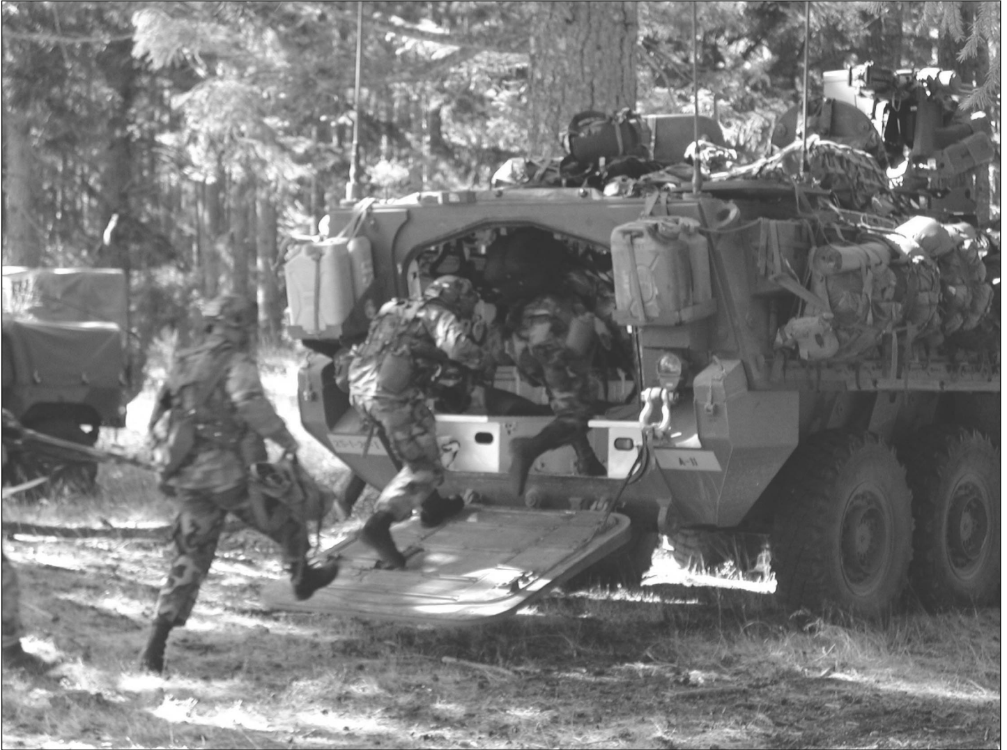
Figure 3: Stryker Infantry Carrier Ingress Excursion