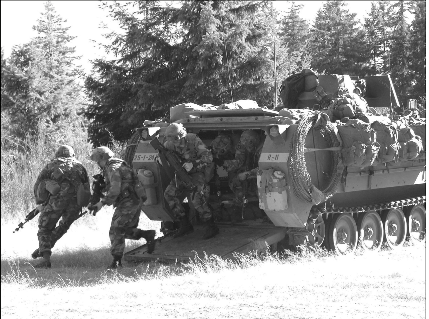
Figure 4: M-113A3 Armored Personnel Carrier Egress Excursion