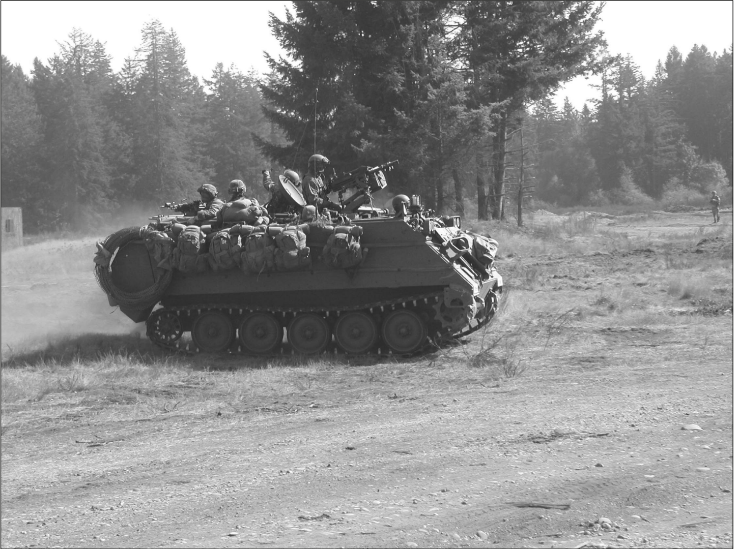
Figure 2: M-113A3 Armored Personnel Carrier