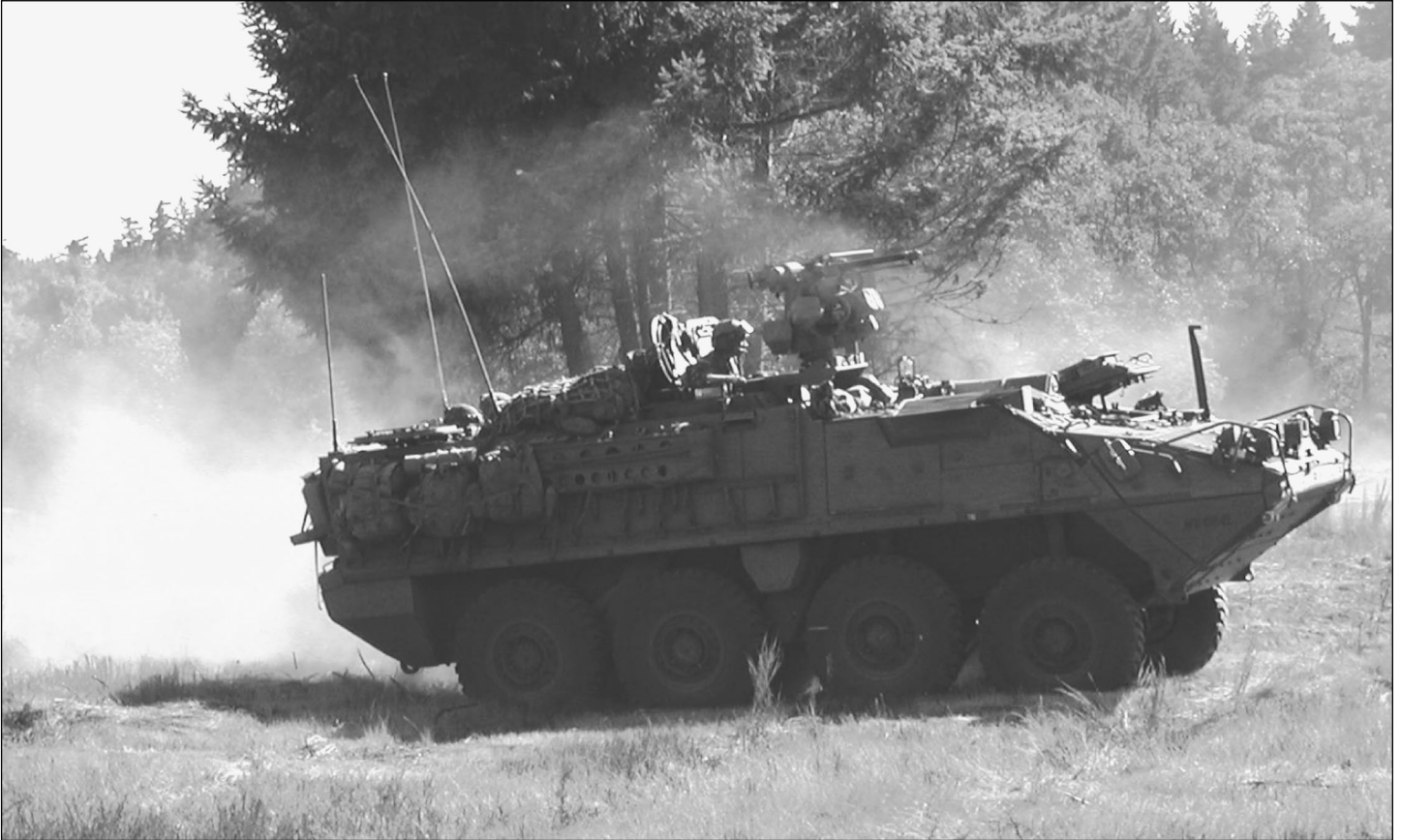
Figure 1: Stryker Infantry Carrier Vehicle