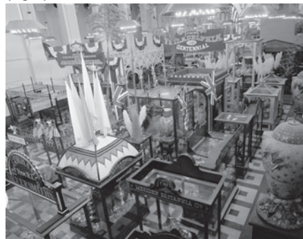
Arts and Industries Building, 1977 (left) and February 2005 (right)

GAO is continuing to evaluate the Smithsonian's efforts to strategically manage, fund, and secure its real property. We expect to publish a report on these issues later this year.