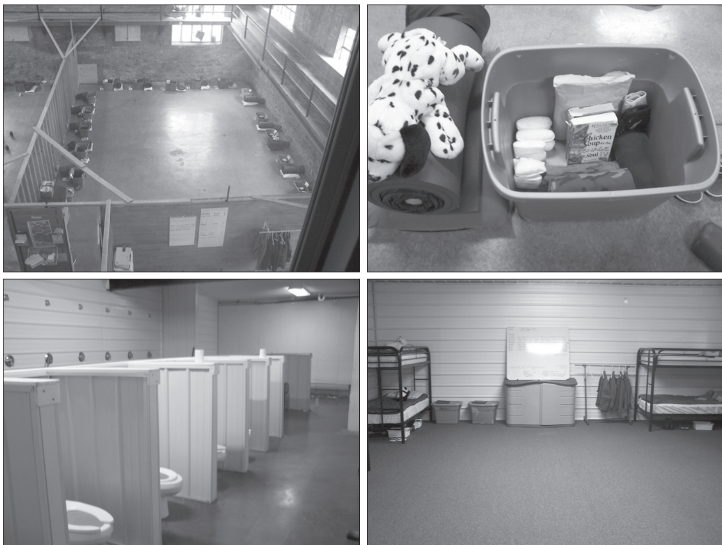
Figure 3: Interior of a Boot Camp Facility That GAO Visited