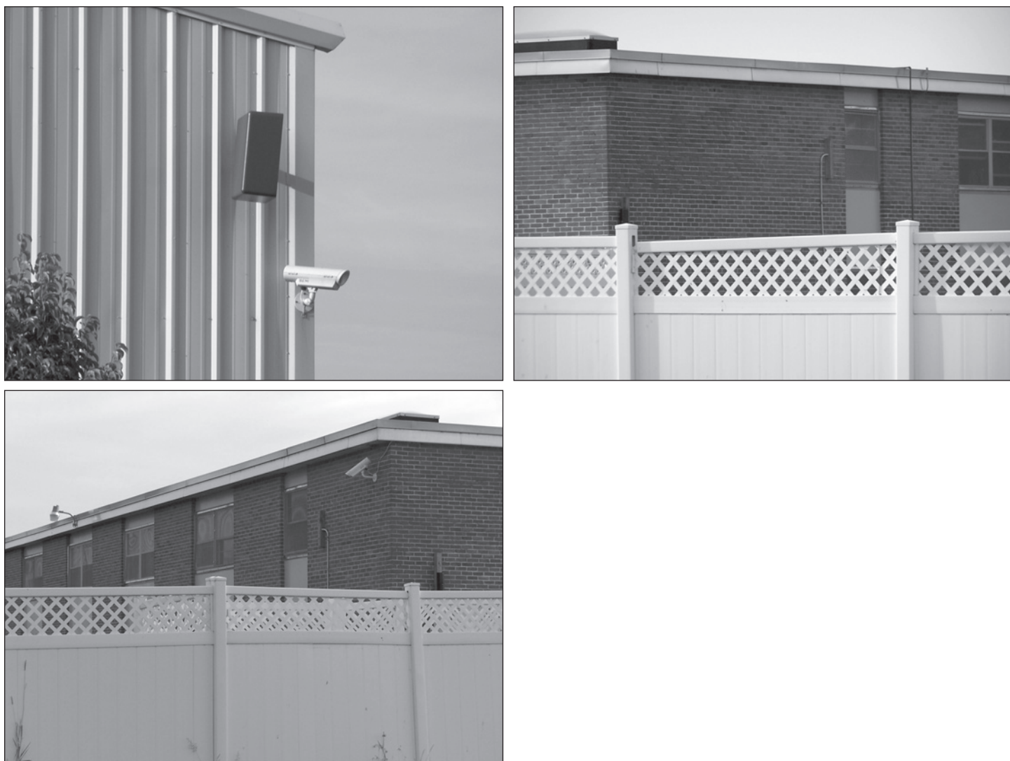
Figure 4: Security Features Employed at a Boarding School GAO Visited