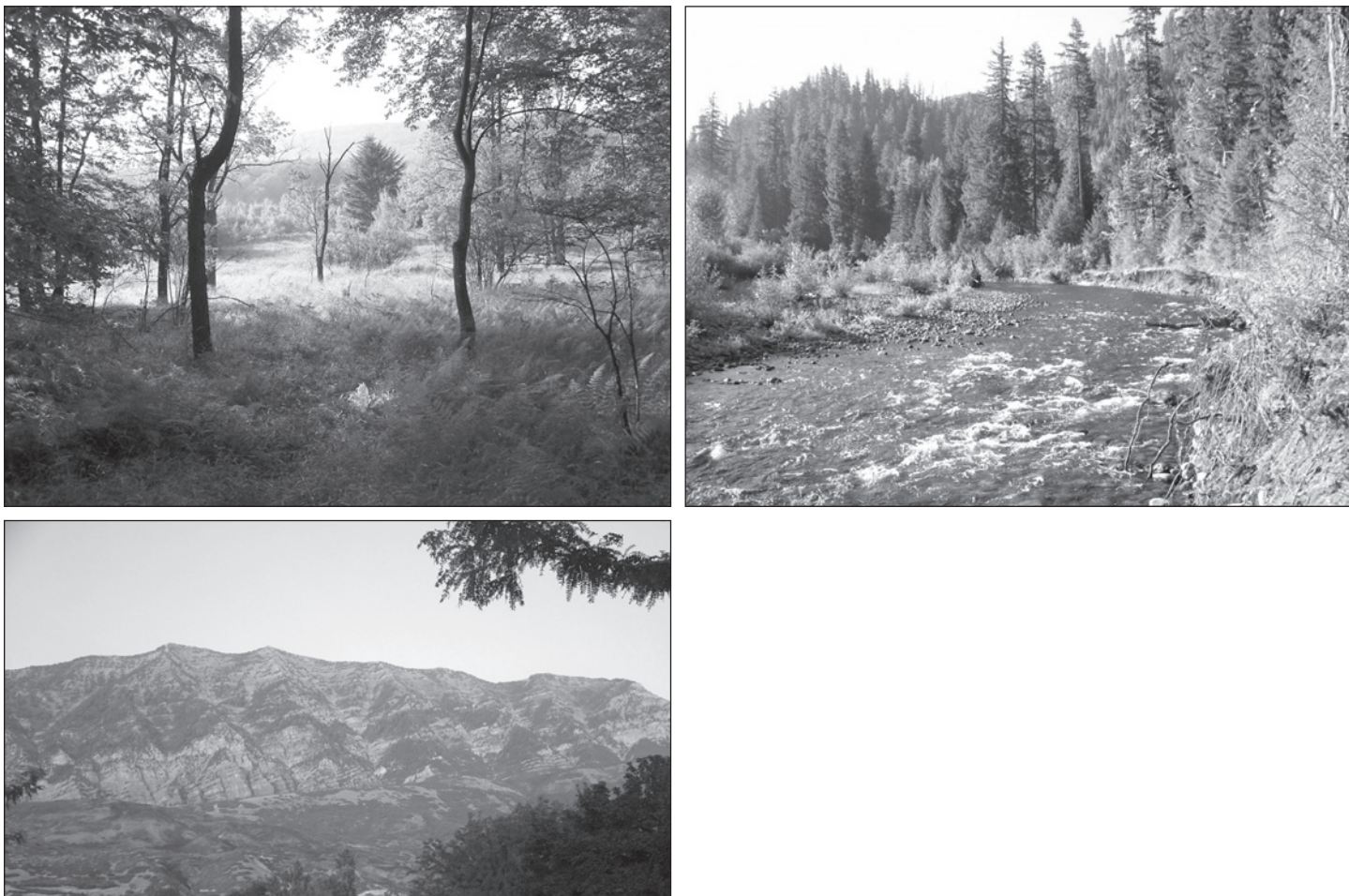
Figure 1: Environments Where Wilderness Therapy Programs Operate