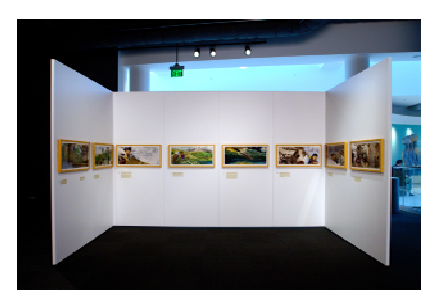
Exhibit Fees, and Other Requirements

Each venue is provided five complete sets of Eagle Books and one Educator's Guide. Additional books may be ordered from the Public Health Foundation. See <u>http://www.cdc.gov/diabetes/pubs/eagle.htm</u> for more information.