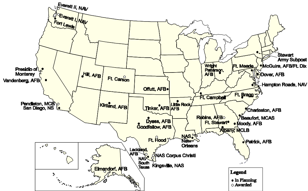
Figure 1. Military Housing Privatization Projects, May 2001