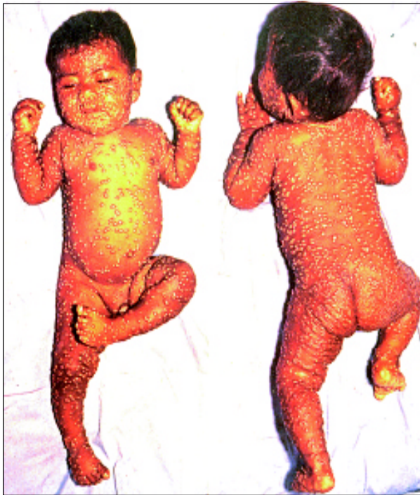
Figure 1. Most cases of smallpox are clinically typical and readily able to be diagnosed. Lesions on each area of the body are at the same stage of development, are deeply embedded in the skin, and are more densely concentrated on the face and extremities.

Smallpox is a viral disease unique to humans. To sustain itself, the virus must pass from person to person in a continuing chain of infection and is spread by inhalation of air droplets or aerosols. Twelve to 14 days after infection, the patient typically becomes febrile and has severe aching pains and prostration. Some 2 to 3 days later, a papular rash develops over the face and spreads to the extremities (Figure 1). The rash soon becomes vesicular and