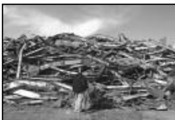
Steel Pile from Building 845

In 1998, the Corps removed 9 drums of mixed waste and approximately 40 bags of personal protective equipment that was stored on the first floor of the building from DOE's efforts.