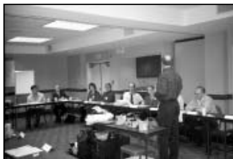
Field Equipment Presentation at April 9, 2002 RAB Meeting