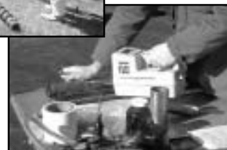
Soil Screening Equipment