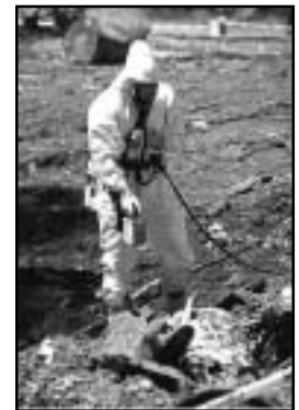
Personnel in Level B Protection with Rad Instrumentation

Level B protective clothing is necessary to prevent field personnel from exposure to potential chemical contaminants. Army Corps work sites will be restricted to field personnel during the sampling effort.