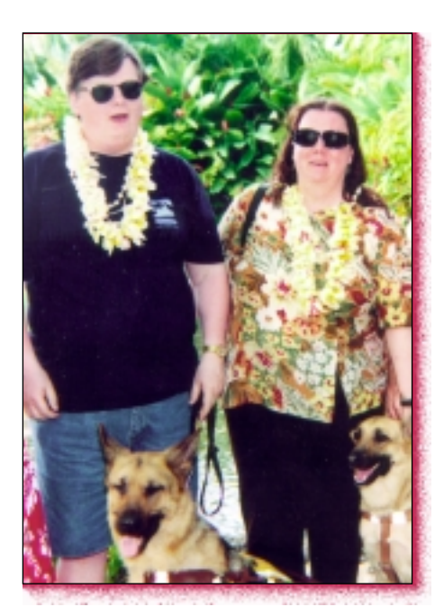
Tourists who are blind can now enjoy Hawaii with their guide dogs.