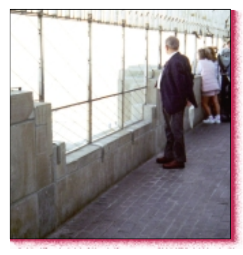
An accessible observation area atop the Empire State Building

decks, restrooms and telephones, but does not cover any privately leased office space in the building.