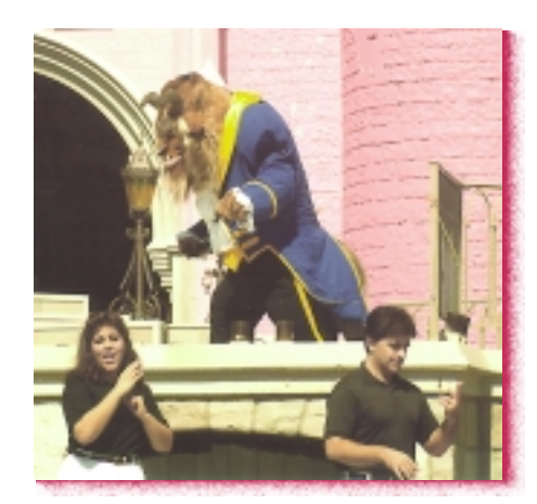
Sign language interpreters at Walt Disney World.