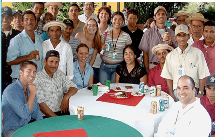
STRI celebrated its Holidays' party on Friday, December 17, at the Tupper Center—Happy New Year to all!