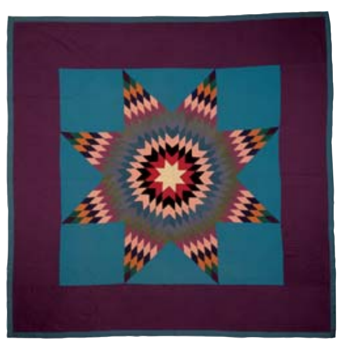
10-B.6 Lone Star Pattern Quilt, c. 1920. Top, plain-weave wool; back, red, green, and white printed-plaid, plain-weave cotton. Overall dimensions 89 \times 89 in. (193 \times 193 cm.). Gift of Irene N. Walsh. Collections of the Heritage Center of Lancaster County, Lancaster. Pa.