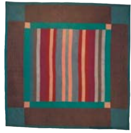
10-B.5 Split Bars Pattern Quilt, c. 1935. Top, plain-weave and crepe wool; back, black-and-white twill printed-pattern plain-weave cotton. Overall dimensions 76 x 76 in. (193 x 193 cm.). Collections of the Heritage Center of Lancaster County, Lancaster, Pa.