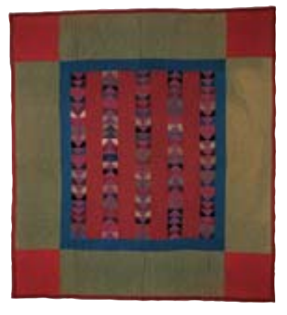
10-B.7 Bars—Wild Goose Chase Pattern Quilt, c. 1920. Top, plain-weave and crepe wool; back, wine-and-white floral-print, plain-weave cotton. Overall dimensions 72.5 x 79.5 in. (184.2 x 201.9 cm.). Gift of Irene N. Walsh. Collections of the Heritage Center of Lancaster County, Lancaster, Pa.