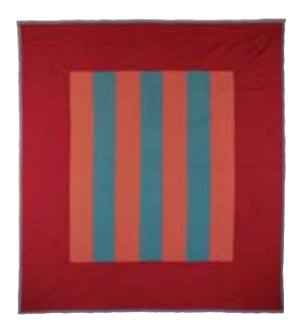
10-B.3 Bars Pattern Quilt, c. 1920. Top, plain-weave wool; back, grey-and-blue plain-weave cotton. Overall dimensions 72 x 80 in. (182.9 x 203.2 cm.). Gift of "The Great Women of Lancaster." Collections of the Heritage Center of Lancaster County, Lancaster, Pa.