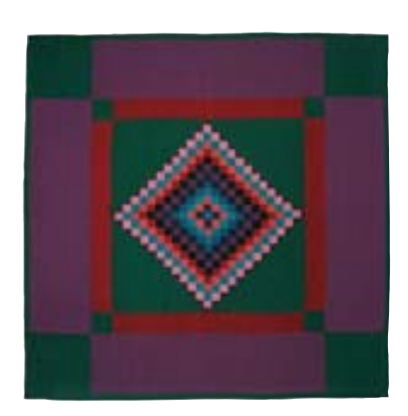
10-B.8 Diamond in the Square—Sunshine and Shadow Variation Pattern Quilt, c. 1935. Top, purple plain- and twill-weave wool; back, purple twill-weave cotton. Overall dimensions 80 x 80 in. (203.2 x 203.2 cm.). Gift of "The Great Women of Lancaster." Collections of the Heritage Center of Lancaster County, Lancaster, Pa.

Many quilts are enriched with stitches in one or more patterns—diamond shapes, feathers, wreaths, vines, and flowers—that add another layer of technical and visual complexity. Although earlier quilts like those reproduced here are thought to be the result of individual efforts among the Lancaster County Amish, in more recent times women often have gathered together to share their needle working skills in community events called quilting bees or "frolics."