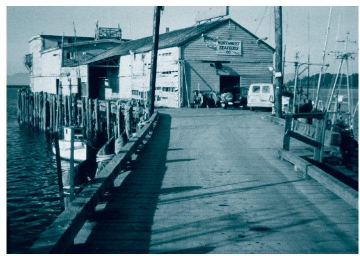
Northwest Seafoods Company Pier in Neah Bay, Washington

In 2006, landings by Pacific fishermen (1.2 billion pounds) had an ex-vessel value of $472 million. Landings revenue was dominated by crab ($144 million) and other shellfish ($115 million). These species and groups accounted for $259 million (55%) of landings revenue. Hake accounted for almost half of the landings in the region in 2006: 570 million pounds.